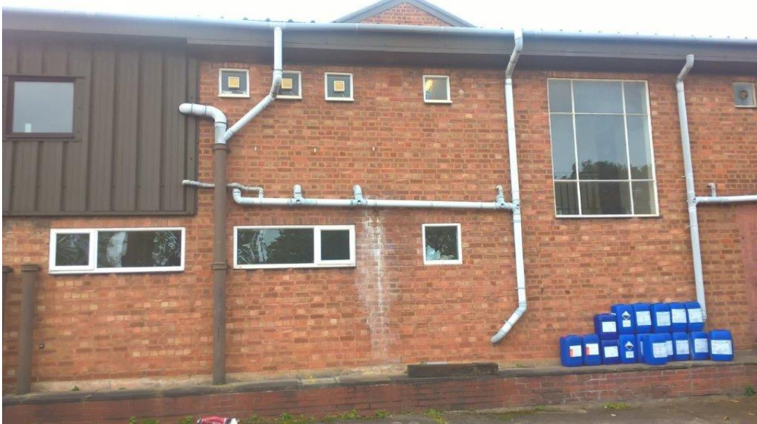
Rear Site Entrance