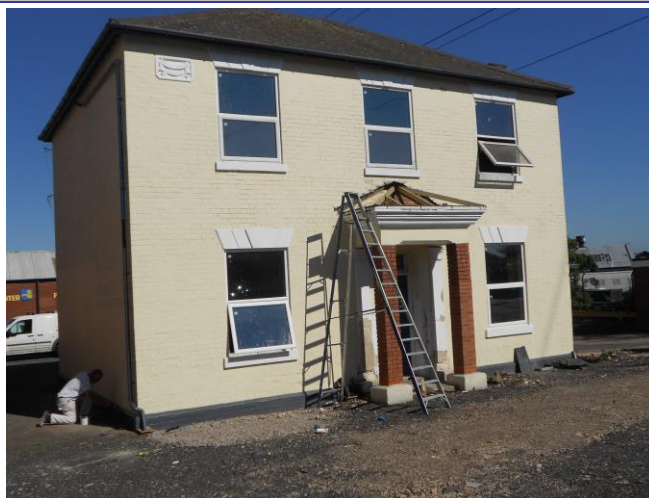
Haye House Front