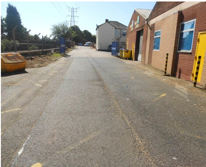
Main Entrance Driveway