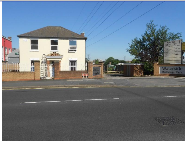
Haye House Front