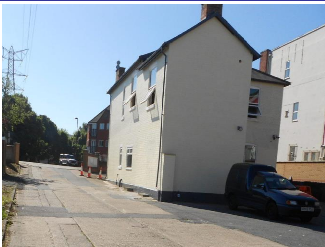
Haye House Main Entrance Driveway