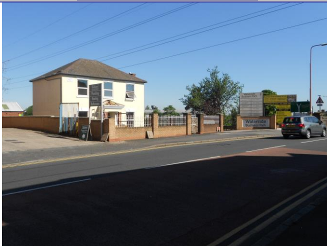
Haye House From the Road