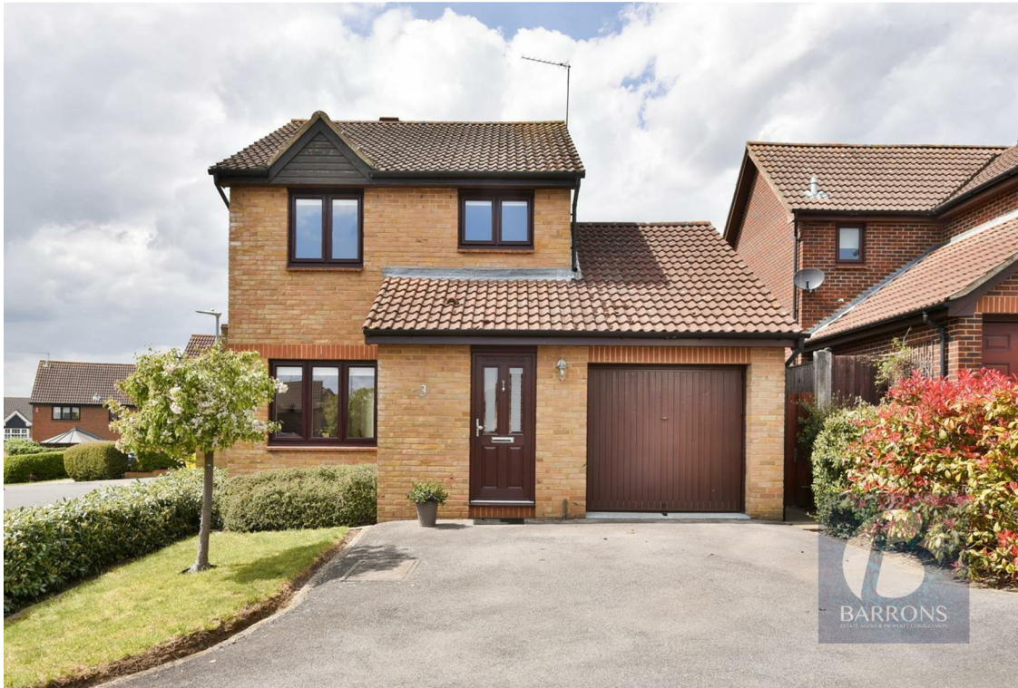
*** AN ATTRACTIVE THREE BEDROOM, TWO RECEPTION ROOM, DETACHED FAMILY HOME, WITH IMPECCABLY PRESENTED INTERIORS, WEST FACING GARDEN AND A 18'2 X 8'8 INTEGRAL GARAGE. ***

An attractive THREE BEDROOM, TWO RECEPTION ROOM, detached family home, commanding an enviable position within this quiet and peaceful cul-de-sac turning, located on the highly regarded "The Laurels" development in West Cheshunt. This fine family home, has been well cared for by the current owners and the accommodation which offers and BRIGHT and AIRY INTERIORS, have been arranged over two floors and comprises of in brief : ENTRANCE HALLWAY. 13'3 X 12'6 LOUNGE, 10'10 X 7'11 DINING ROOM with BI-FOLDING DOORS leading to garden, 10'10 X 7'7 KITCHEN, 8'1 X 7'4 UTILITY ROOM and CLOAKROOM. On the first floor, there are THREE well proportioned bedrooms each measuring: 12'10 x 9'0 BEDROOM ONE with fitted floor to ceiling wardrobes, 9'2 x 8'0 BEDROOM TWO with fitted floor to ceiling wardrobes, 9'6 x 6'5 BEDROOM THREE and there is a spacious family bathroom off the landing. Outside, the established and private gardens enjoy a WEST FACING ASPECT and has been mainly laid to lawn, boarded by a selection of mature shrubs and colourful flowers, providing the ideal environment for alfresco dining and home entertaining. The property is approached via a paved driveway providing access to the 18'2 X 8'8 INTEGRAL GARAGE. THE FIRS, is ideally situated on the western fringes of Cheshunt bordering Goff's Oak Village, with fine country walks and highly regarded schooling being close by. Cuffley Village with its excellent transport links to London's Kings Cross & Moorgate is approximately 1.5 miles.