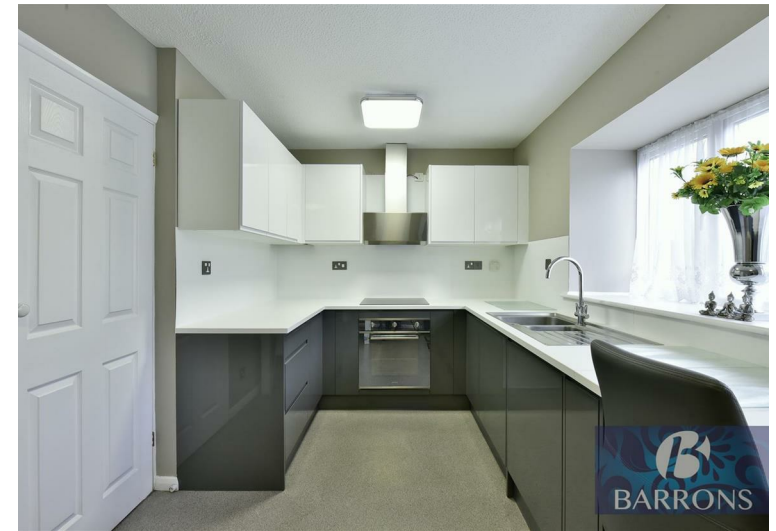
Ground Floor Area: 37.0 m 2 ... 398 ft 2