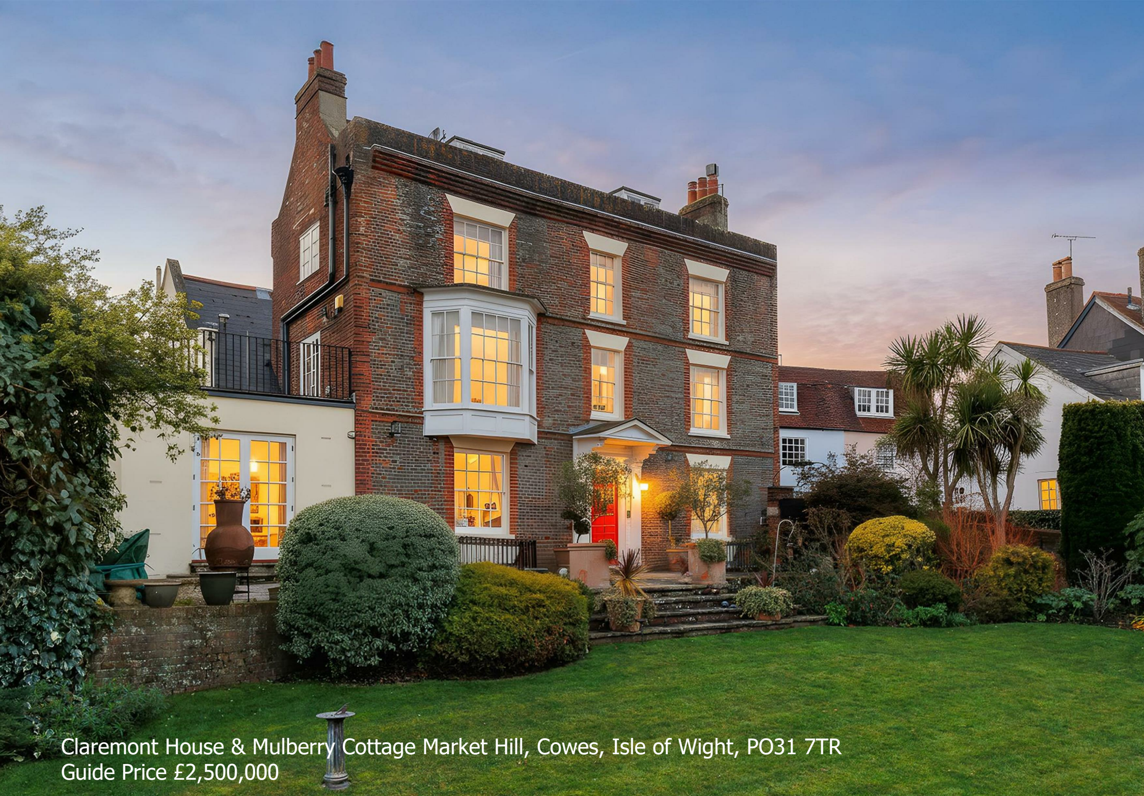
Claremont House & Mulberry Cottage Market Hill, Cowes, Isle of Wight, PO31 7TR Guide Price £2,500,000