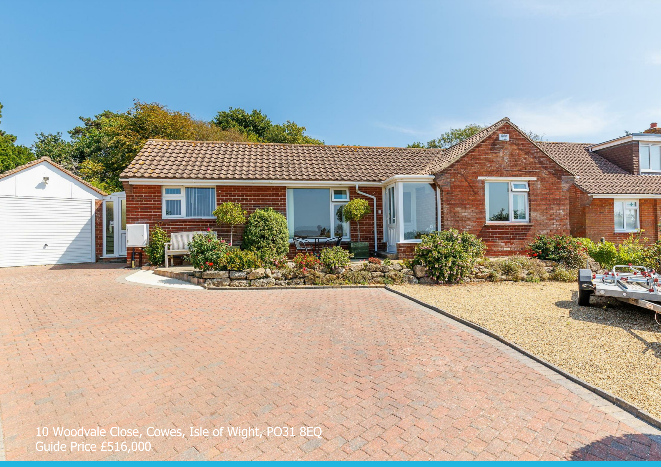
10 Woodvale Close, Cowes, Isle of Wight, PO31 8EQ Guide Price £516,000