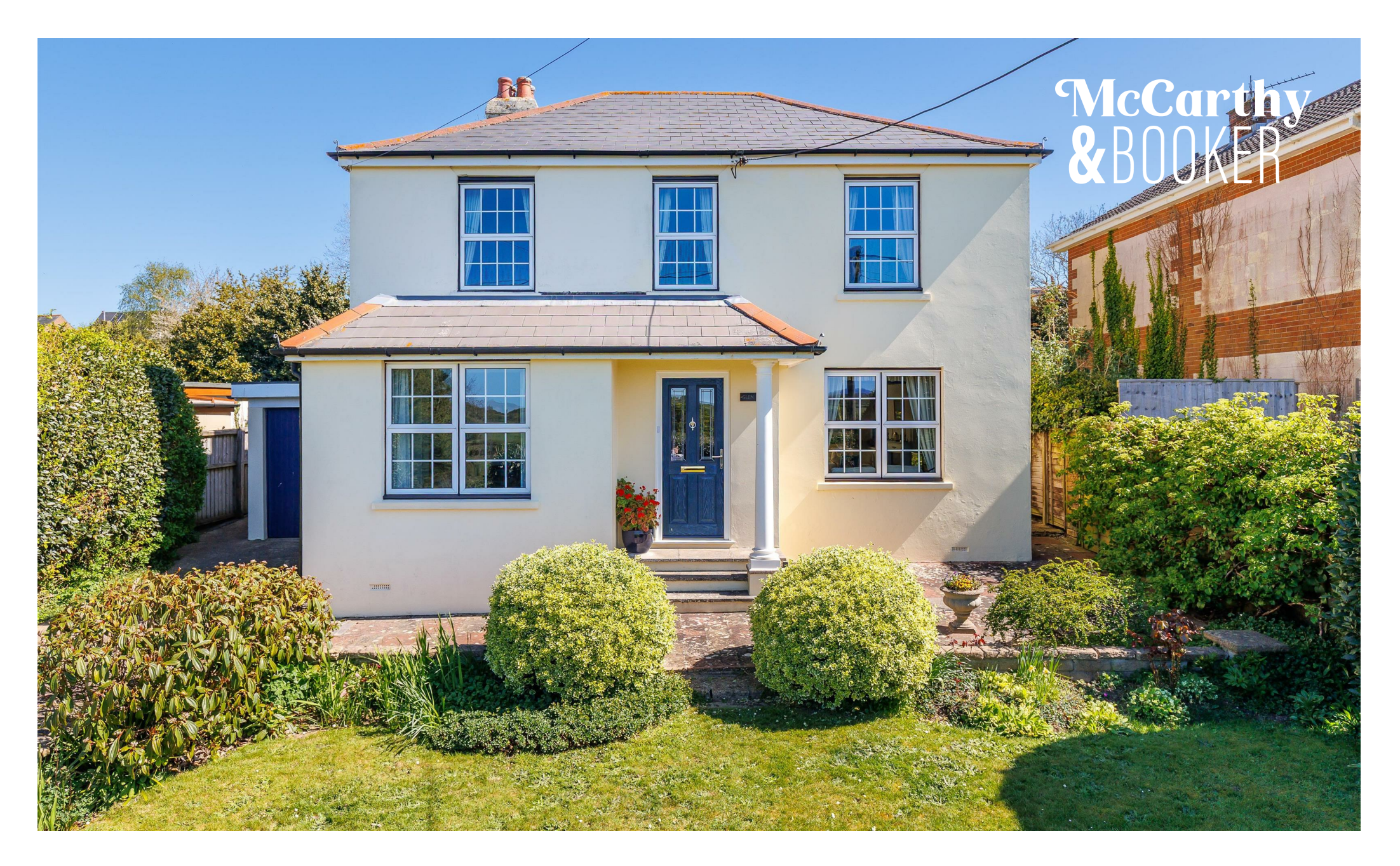
19 Cockleton Lane, Gurnard, Isle of Wight, PO31 8JE