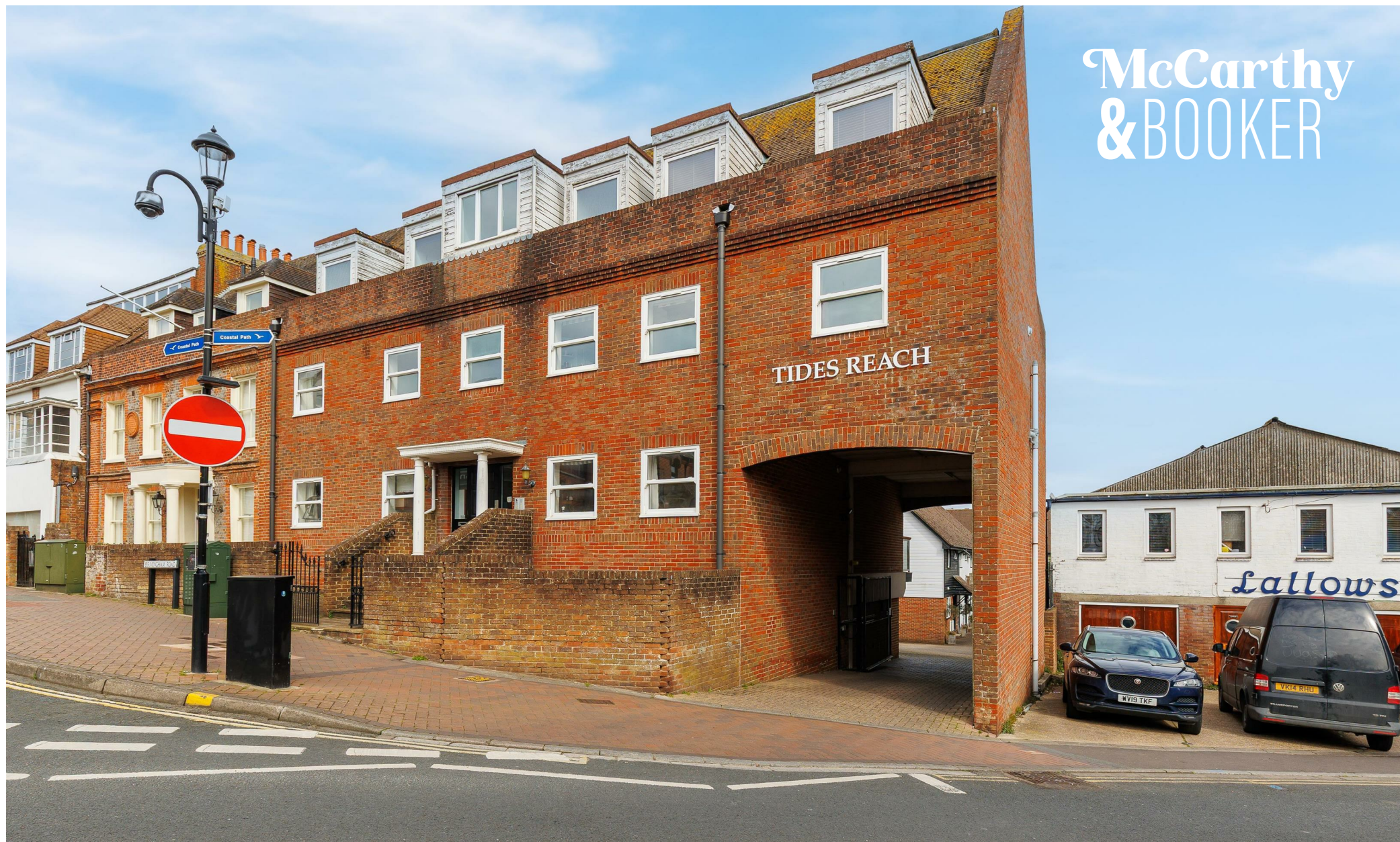
3 Tides Reach, Cowes, Isle Of Wight, PO31 7NU