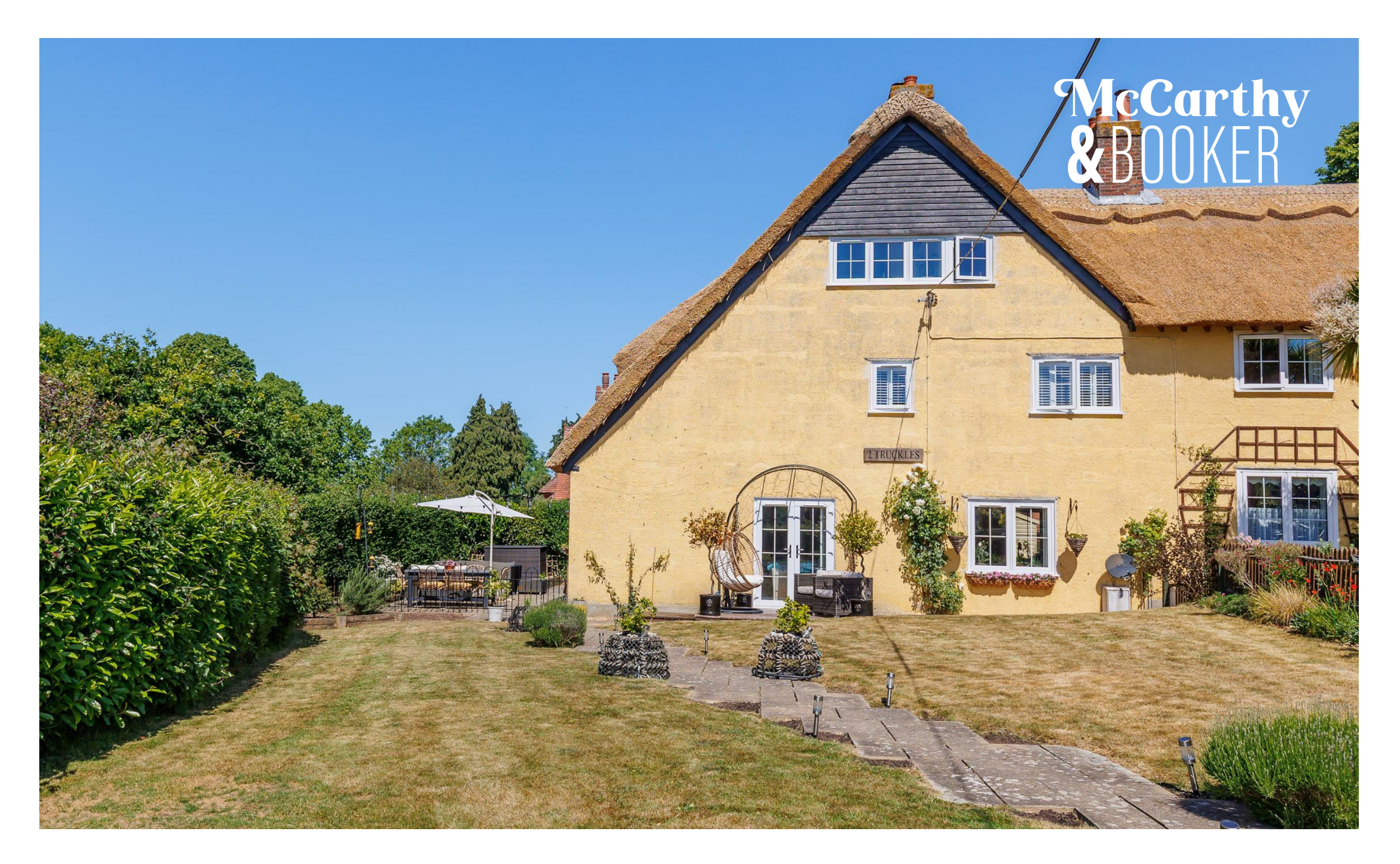
2 Truckles Cottages Beatrice Avenue, East Cowes, Isle of Wight, PO32