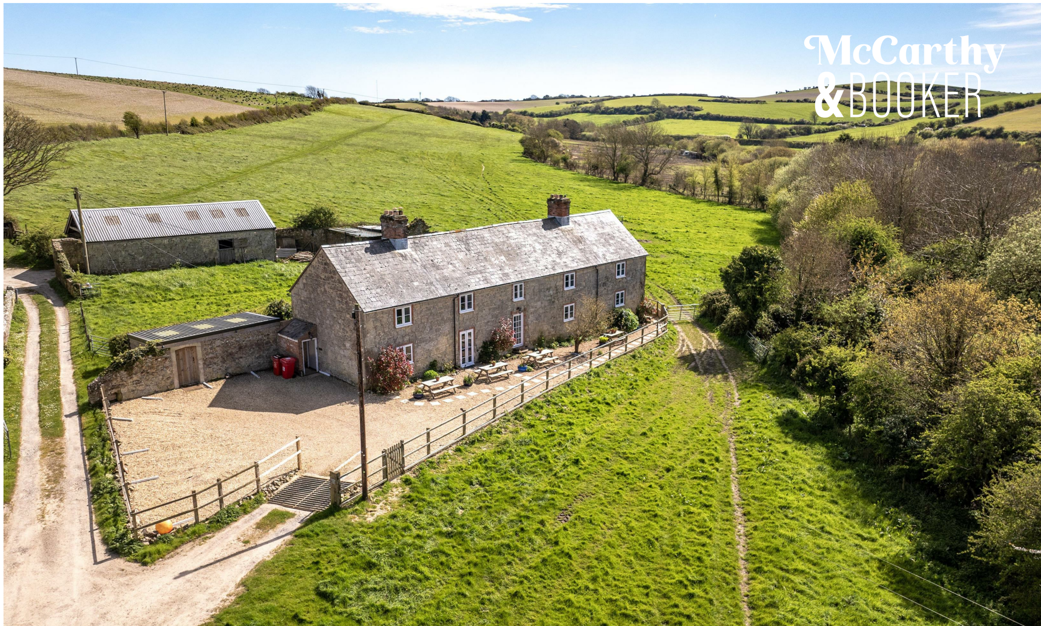
Beryl Farm Cottages Nettlecombe Lane, Whitwell, Isle of Wight, Guide Price £895,000