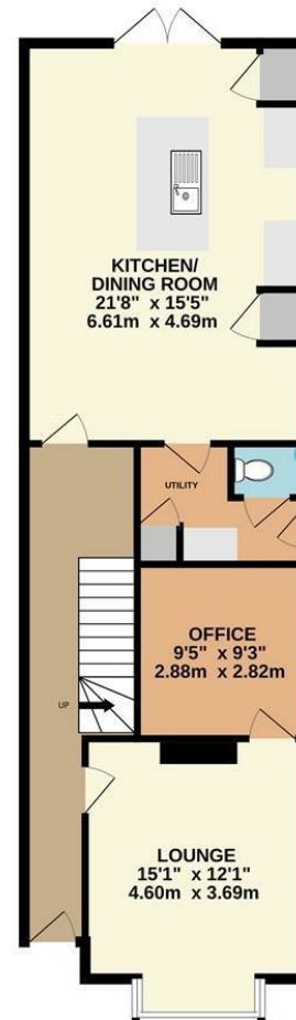
GROUND FLOOR 783 sq.ft. (72.8 sq.m.) approx.