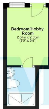
Basement Approx. 8.7 sq. metres (93.3 sq. feet)