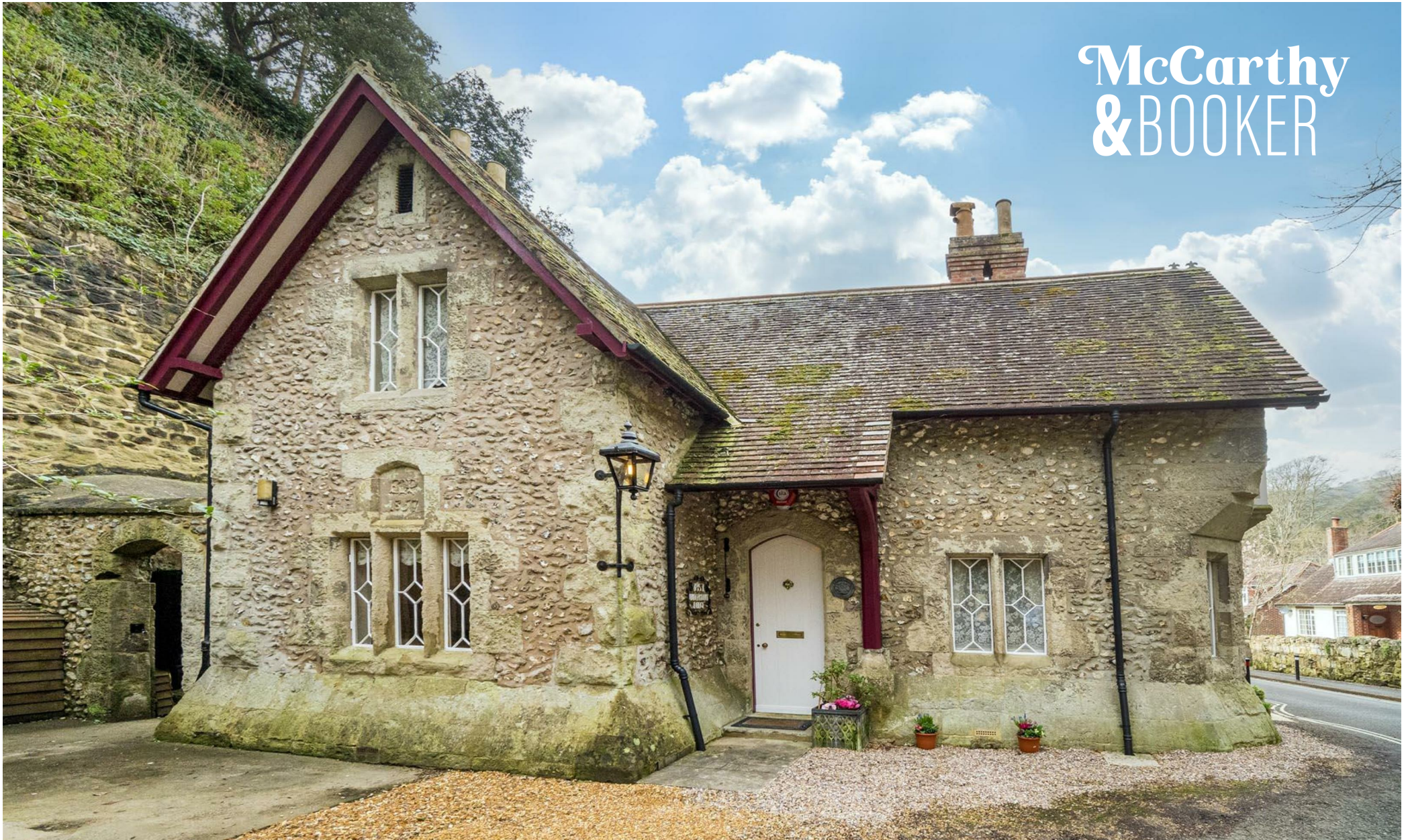
Undermount Lodge Bonchurch Village Road, Ventnor, Isle of Wight, Guide Price £325,000