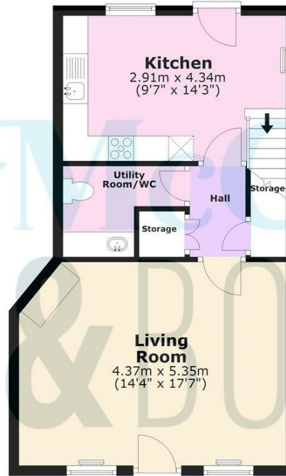
Ground Floor Approx. 44.5 sq. metres (478.8 sq. feet)