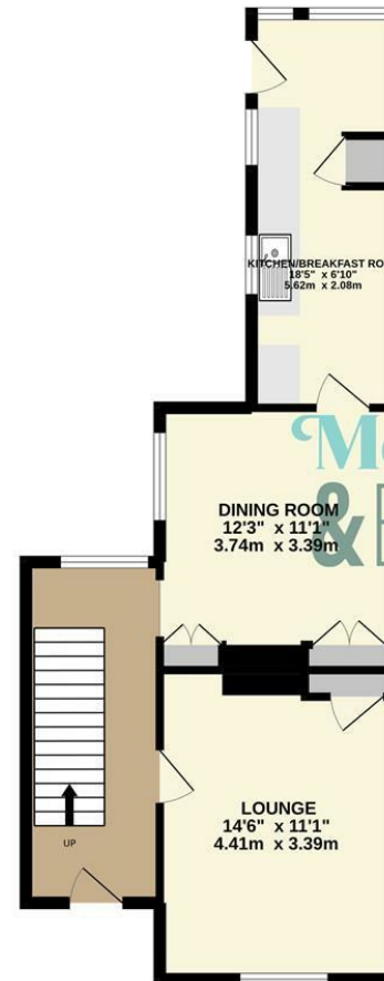
GROUND FLOOR 516 sq.ft. (47.9 sq.m.) approx.