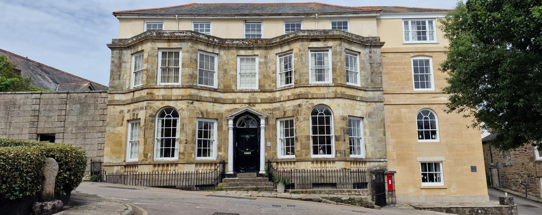
The Willows, Church Street Guide Price £190,000