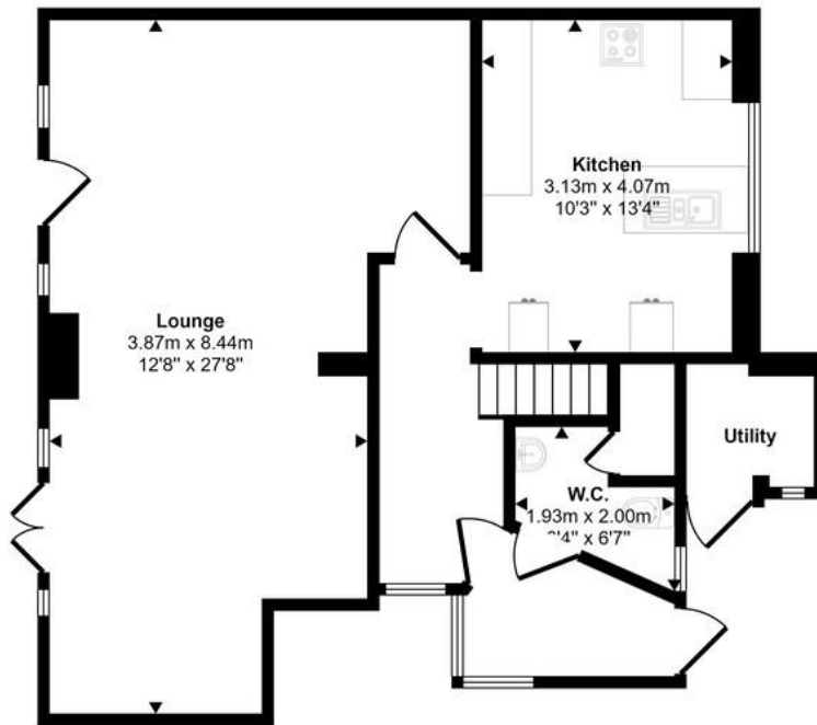
Ground Floor Approx 66 sq m / 712 sq ft

Approx Gross Internal Area 117 sq m / 1264 sq ft