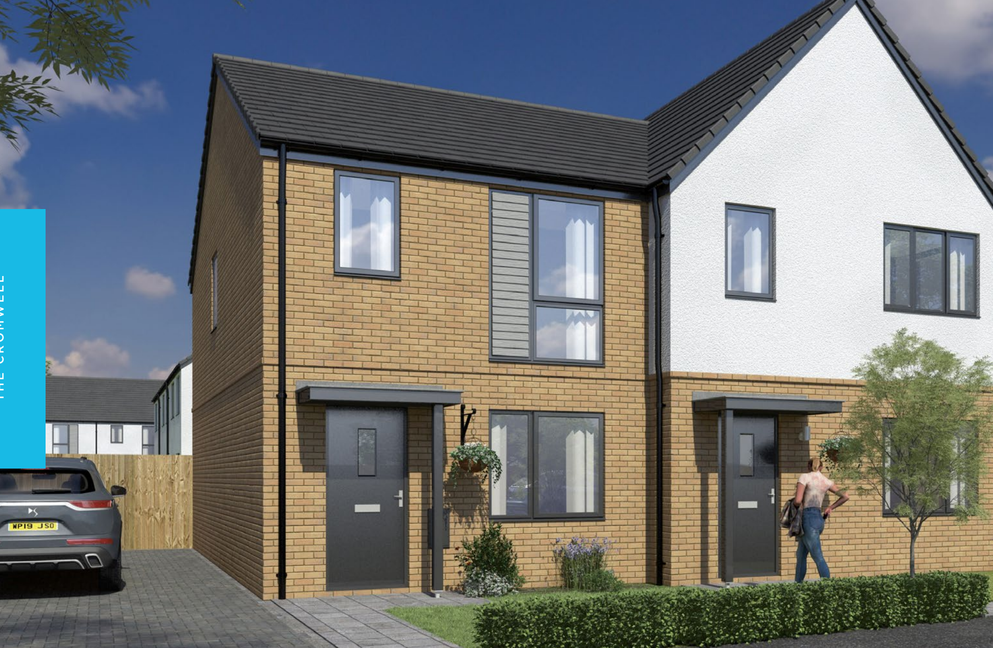
This image is from an imaginary viewpoint within an open space area. Its purpose is to give a feel for the development, not an accurate description of each property. The illustration shows a typical Platform Home Ownership home of this type, but there are, however, variances from site to site. External materials, finishes, landscaping, windows and the position of garages, (where provided) may vary throughout the development. Properties may also be built handed (mirror image). Please ask for further details.