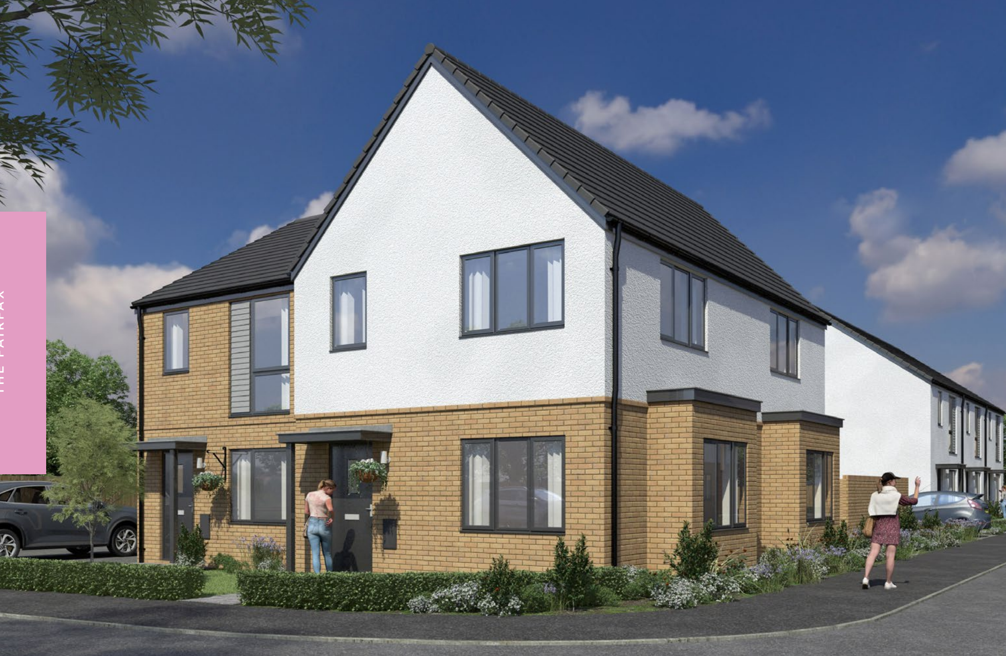
This image is from an imaginary viewpoint within an open space area. Its purpose is to give a feel for the development, not an accurate description of each property. The illustration shows a typical Platform Home Ownership home of this type, but there are, however, variances from site to site. External materials, finishes, landscaping, windows and the position of garages, (where provided) may vary throughout the development. Properties may also be built handed (mirror image). Please ask for further details.