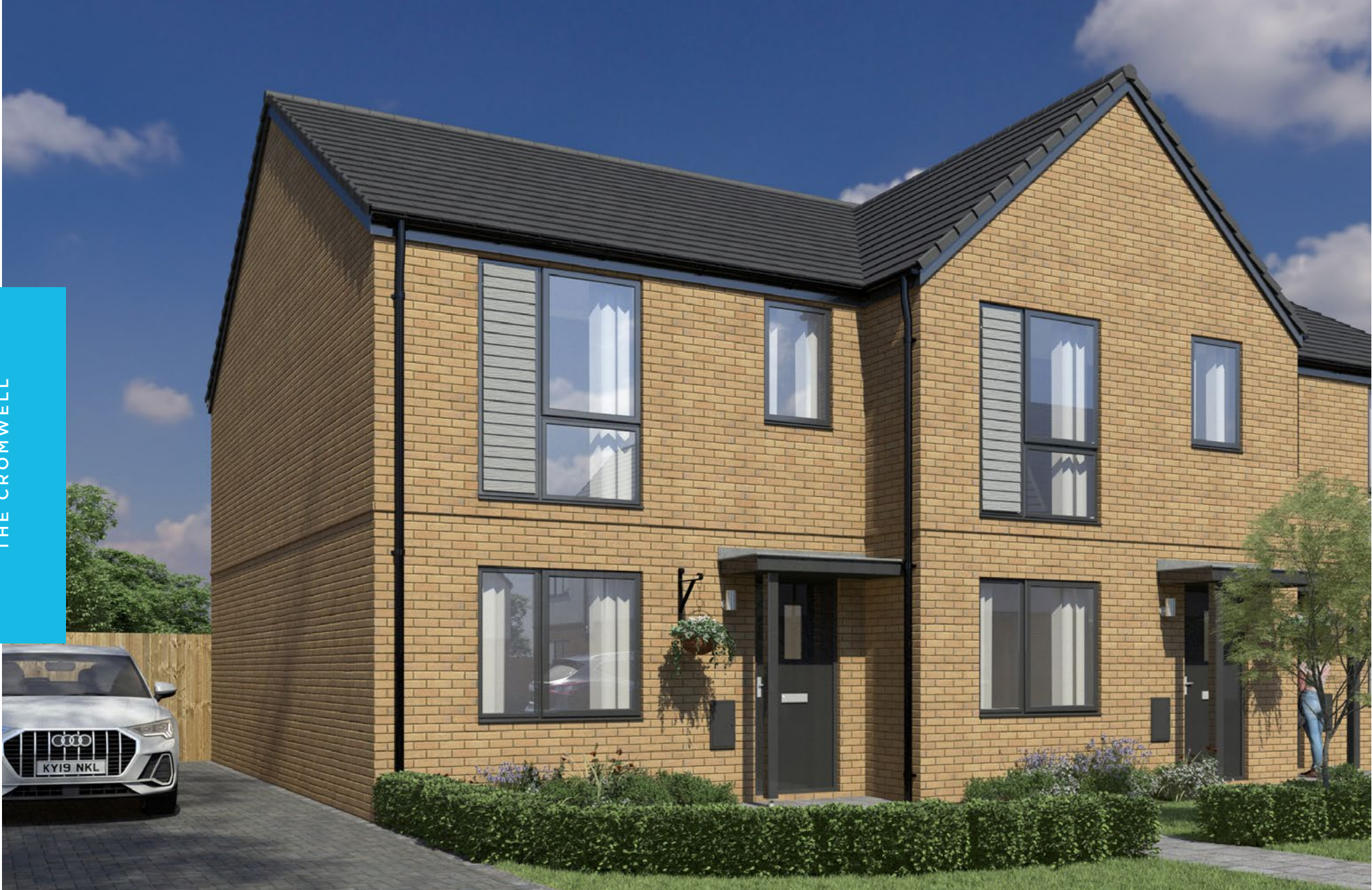
This image is from an imaginary viewpoint within an open space area. Its purpose is to give a feel for the development, not an accurate description of each property. The illustration shows a typical Platform Home Ownership home of this type, but there are, however, variances from site to site. External materials, finishes, landscaping, windows and the position of garages, (where provided) may vary throughout the development. Properties may also be built handed (mirror image). Please ask for further details.