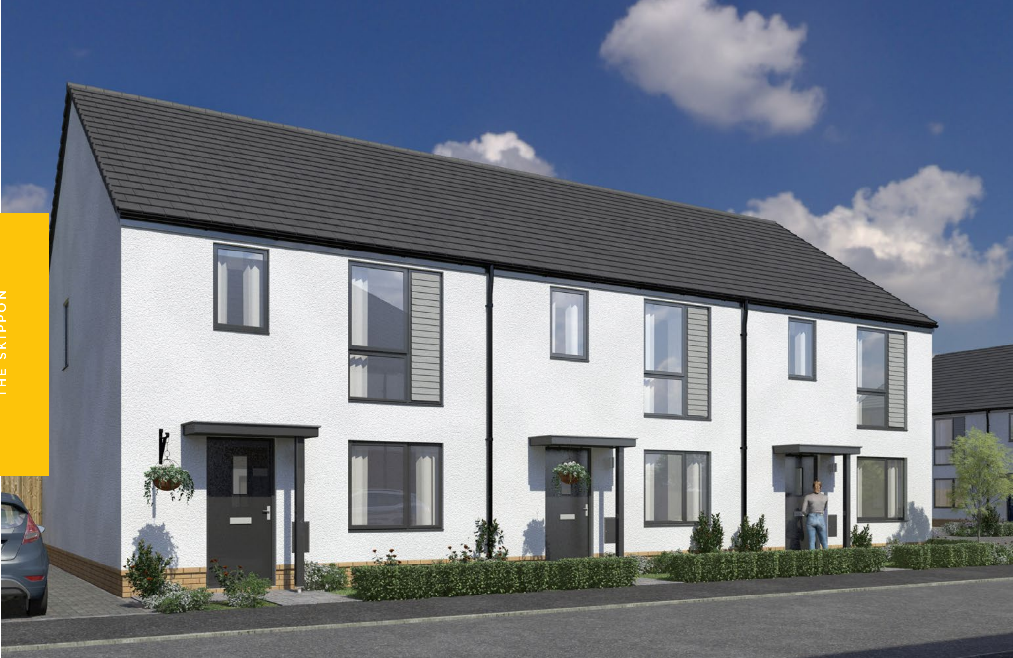
This image is from an imaginary viewpoint within an open space area. Its purpose is to give a feel for the development, not an accurate description of each property. The illustration shows a typical Platform Home Ownership home of this type, but there are, however, variances from site to site. External materials, finishes, landscaping, windows and the position of garages, (where provided) may vary throughout the development. Properties may also be built handed (mirror image). Please ask for further details.