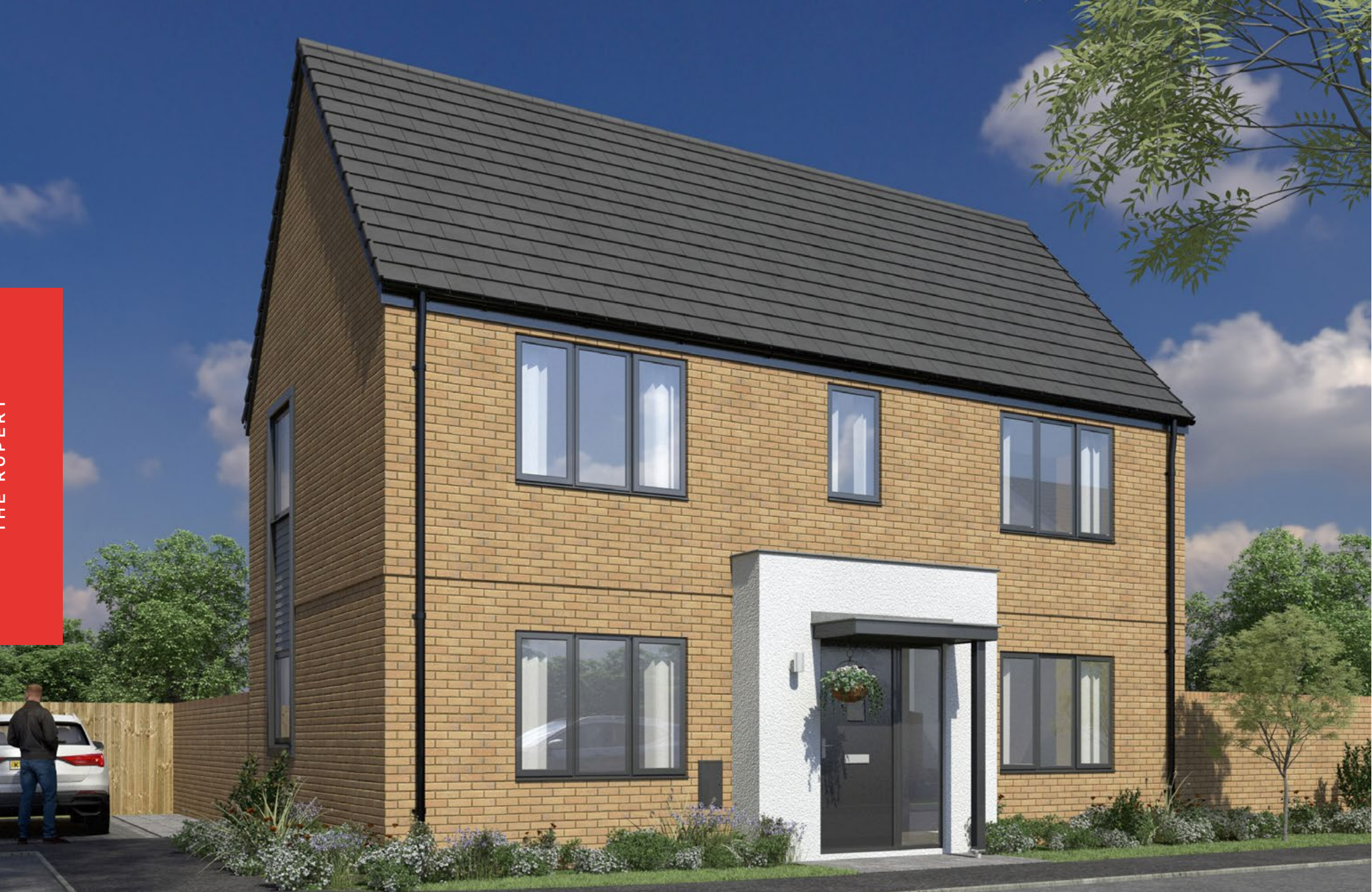
This image is from an imaginary viewpoint within an open space area. Its purpose is to give a feel for the development, not an accurate description of each property. The illustration shows a typical Platform Home Ownership home of this type, but there are, however, variances from site to site. External materials, finishes, landscaping, windows and the position of garages, (where provided) may vary throughout the development. Properties may also be built handed (mirror image). Please ask for further details.