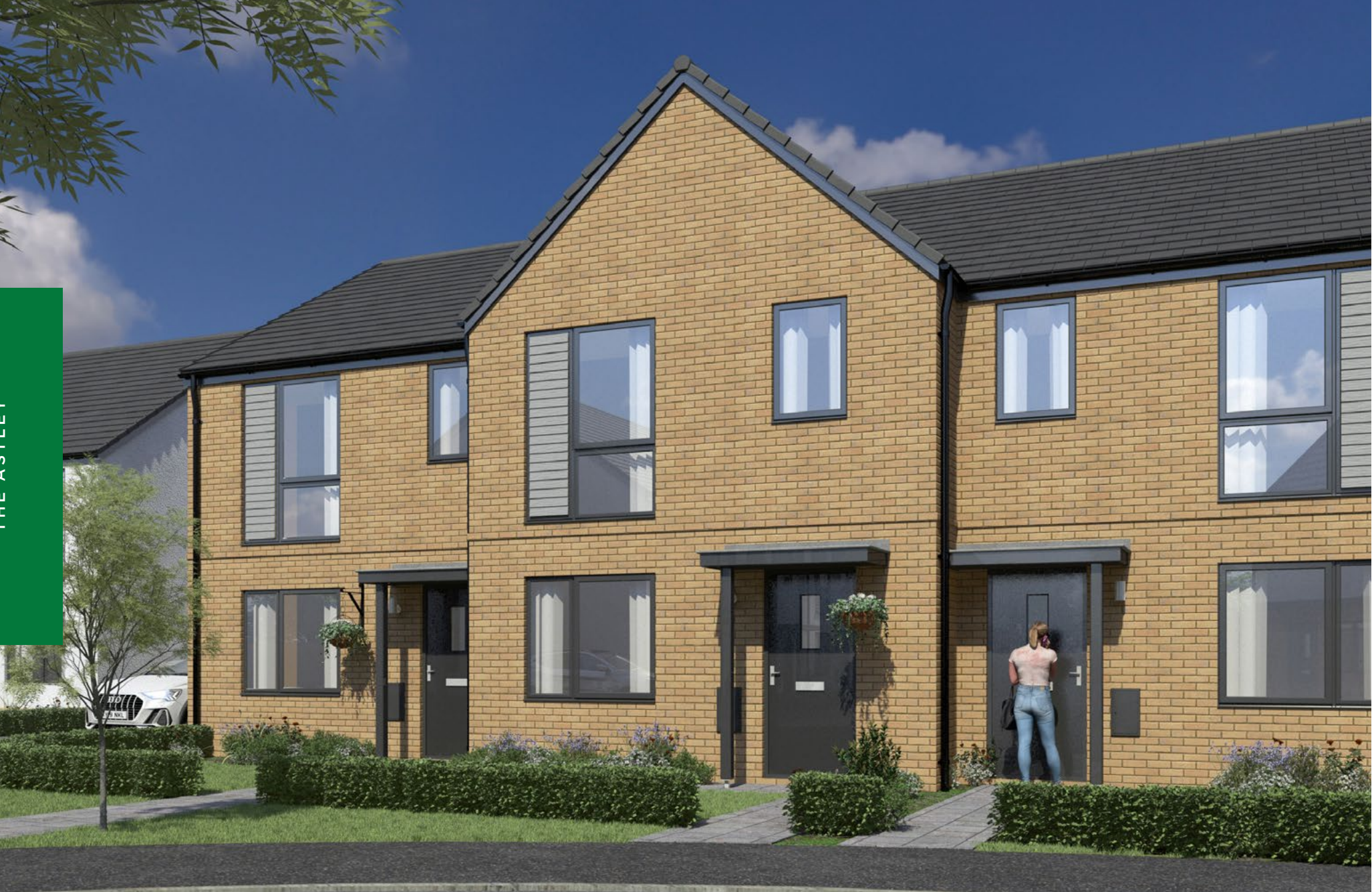
This image is from an imaginary viewpoint within an open space area. Its purpose is to give a feel for the development, not an accurate description of each property. The illustration shows a typical Platform Home Ownership home of this type, but there are, however, variances from site to site. External materials, finishes, landscaping, windows and the position of garages, (where provided) may vary throughout the development. Properties may also be built handed (mirror image). Please ask for further details.