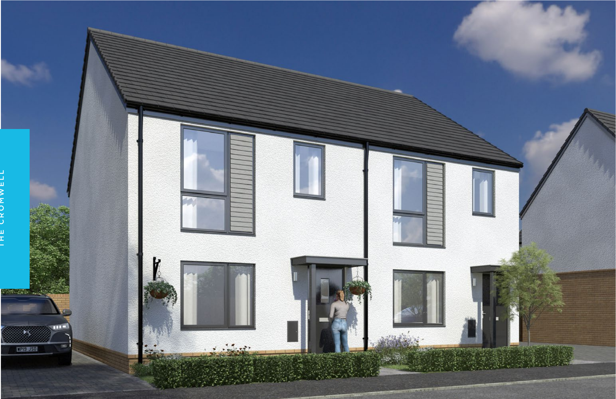
This image is from an imaginary viewpoint within an open space area. Its purpose is to give a feel for the development, not an accurate description of each property. The illustration shows a typical Platform Home Ownership home of this type, but there are, however, variances from site to site. External materials, finishes, landscaping, windows and the position of garages, (where provided) may vary throughout the development. Properties may also be built handed (mirror image). Please ask for further details.