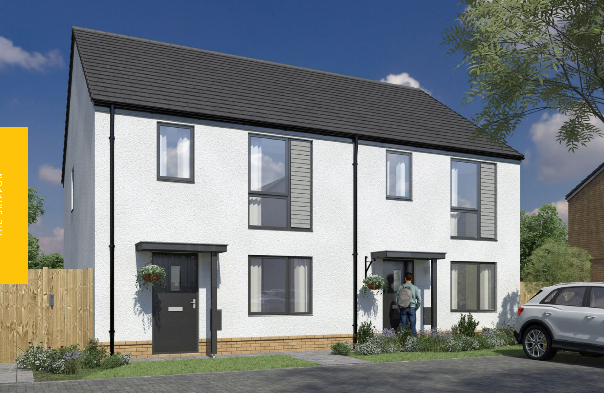
This image is from an imaginary viewpoint within an open space area. Its purpose is to give a feel for the development, not an accurate description of each property. The illustration shows a typical Platform Home Ownership home of this type, but there are, however, variances from site to site. External materials, finishes, landscaping, windows and the position of garages, (where provided) may vary throughout the development. Properties may also be built handed (mirror image). Please ask for further details.