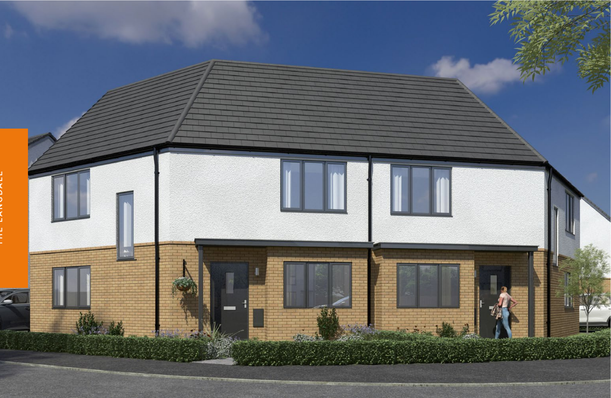
This image is from an imaginary viewpoint within an open space area. Its purpose is to give a feel for the development, not an accurate description of each property. The illustration shows a typical Platform Home Ownership home of this type, but there are, however, variances from site to site. External materials, finishes, landscaping, windows and the position of garages, (where provided) may vary throughout the development. Properties may also be built handed (mirror image). Please ask for further details.