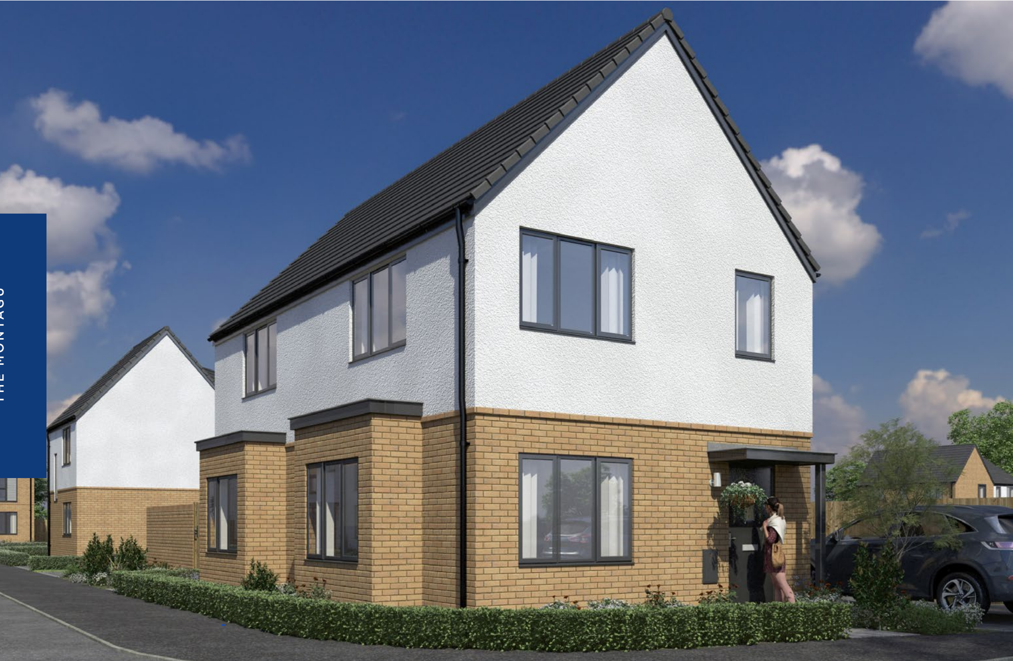
This image is from an imaginary viewpoint within an open space area. Its purpose is to give a feel for the development, not an accurate description of each property. The illustration shows a typical Platform Home Ownership home of this type, but there are, however, variances from site to site. External materials, finishes, landscaping, windows and the position of garages, (where provided) may vary throughout the development. Properties may also be built handed (mirror image). Please ask for further details.