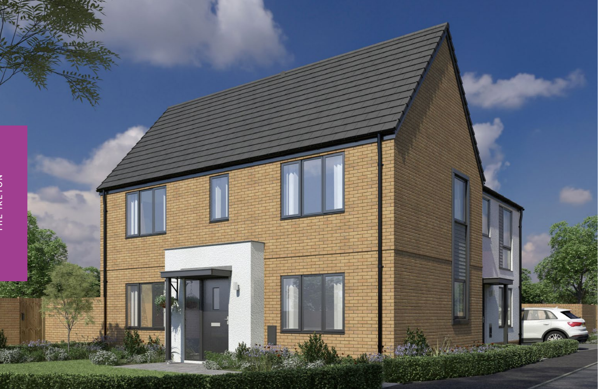
This image is from an imaginary viewpoint within an open space area. Its purpose is to give a feel for the development, not an accurate description of each property. The illustration shows a typical Platform Home Ownership home of this type, but there are, however, variances from site to site. External materials, finishes, landscaping, windows and the position of garages, (where provided) may vary throughout the development. Properties may also be built handed (mirror image). Please ask for further details.