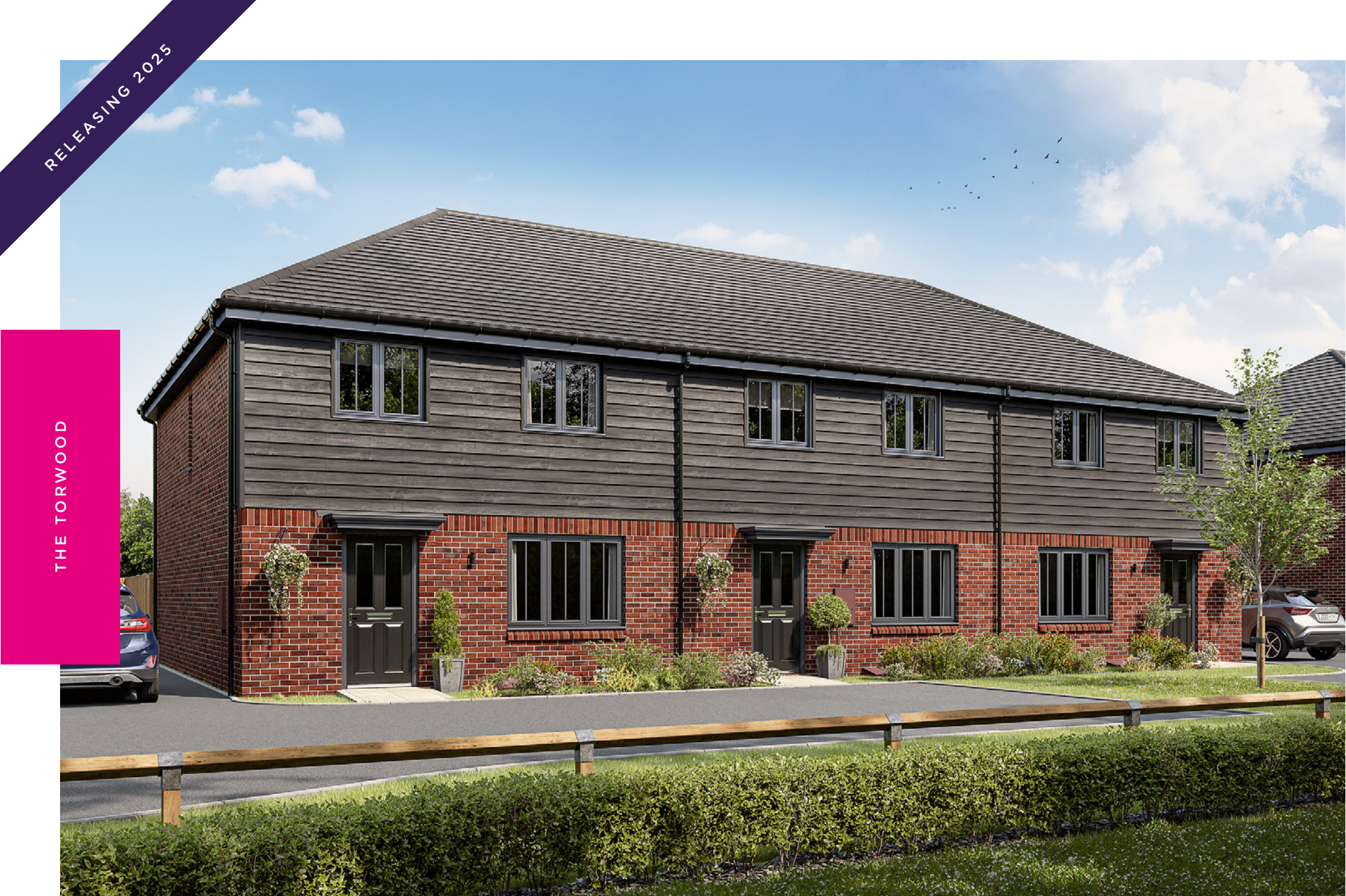
This image is from an imaginary viewpoint within an open space area. Its purpose is to give a feel for the development, not an accurate description of each property. The illustration shows a typical Platform Home Ownership home of this type, but there are, however, variances from site to site. External materials, finishes, landscaping, windows and the position of garages, (where provided) may vary throughout the development. Properties may also be built handed (mirror image). Please ask for further details.