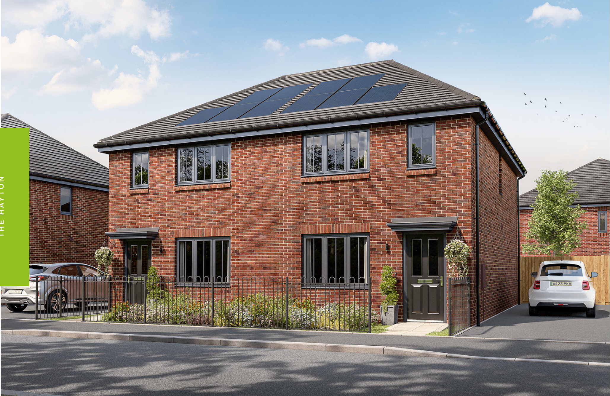
This image is from an imaginary viewpoint within an open space area. Its purpose is to give a feel for the development, not an accurate description of each property. The illustration shows a typical Platform Home Ownership home of this type, but there are, however, variances from site to site. External materials, finishes, landscaping, windows and the position of garages, (where provided) may vary throughout the development. Properties may also be built handed (mirror image). Please ask for further details.