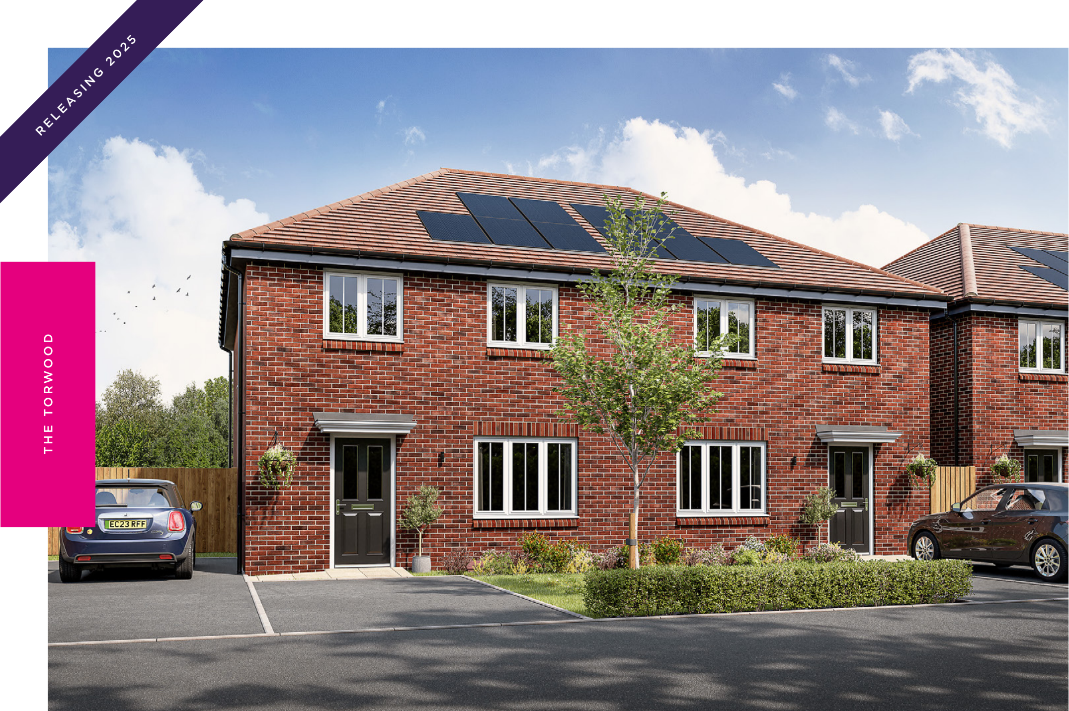
This image is from an imaginary viewpoint within an open space area. Its purpose is to give a feel for the development, not an accurate description of each property. The illustration shows a typical Platform Home Ownership home of this type, but there are, however, variances from site to site. External materials, finishes, landscaping, windows and the position of garages, (where provided) may vary throughout the development. Properties may also be built handed (mirror image). Please ask for further details.