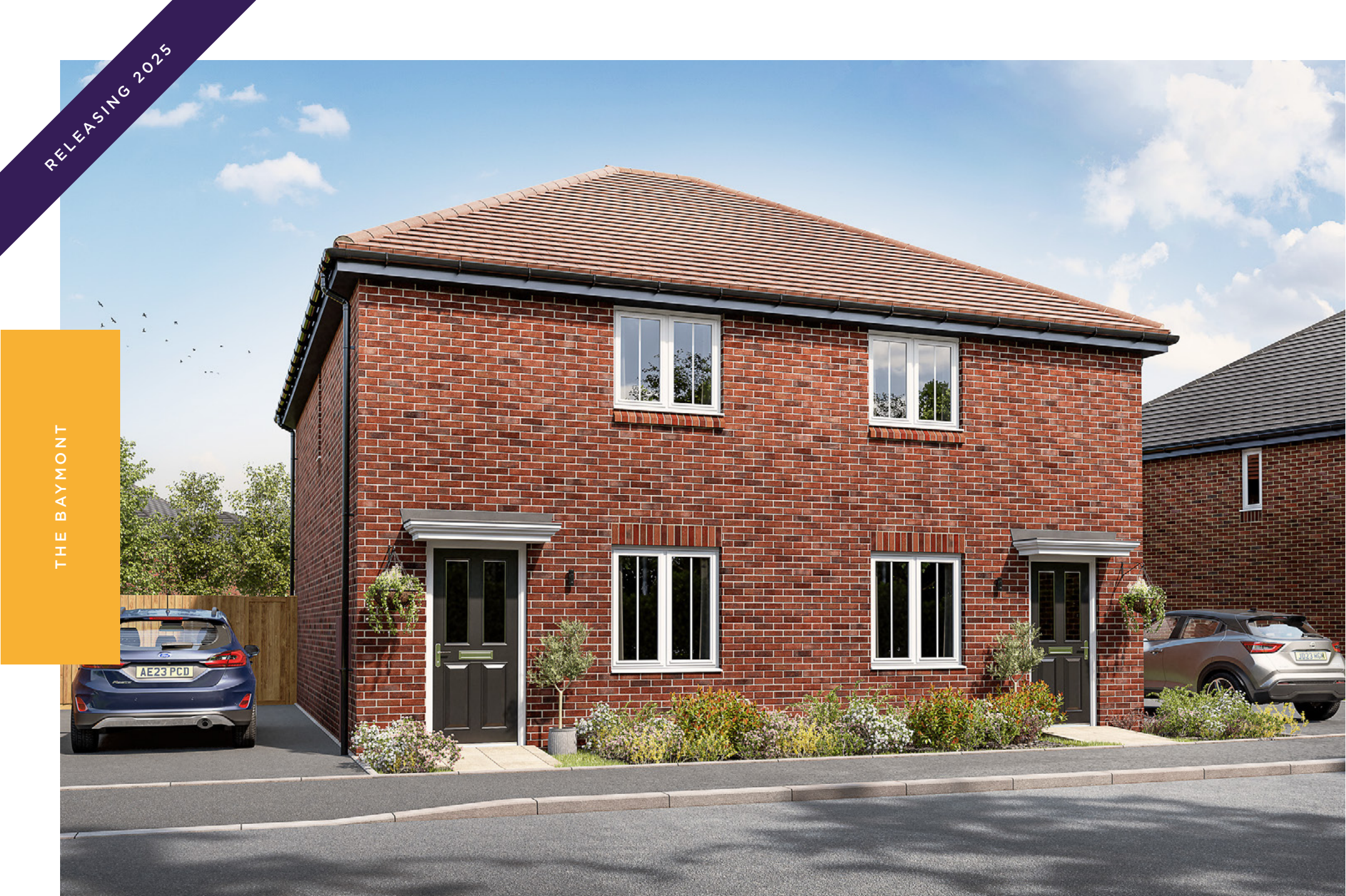
This image is from an imaginary viewpoint within an open space area. Its purpose is to give a feel for the development, not an accurate description of each property. The illustration shows a typical Platform Home Ownership home of this type, but there are, however, variances from site to site. External materials, finishes, landscaping, windows and the position of garages, (where provided) may vary throughout the development. Properties may also be built handed (mirror image). Please ask for further details.