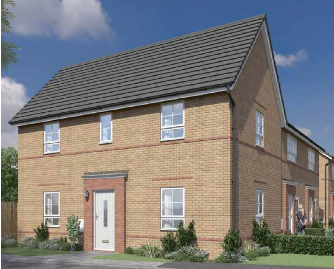
Computer generated image shown.