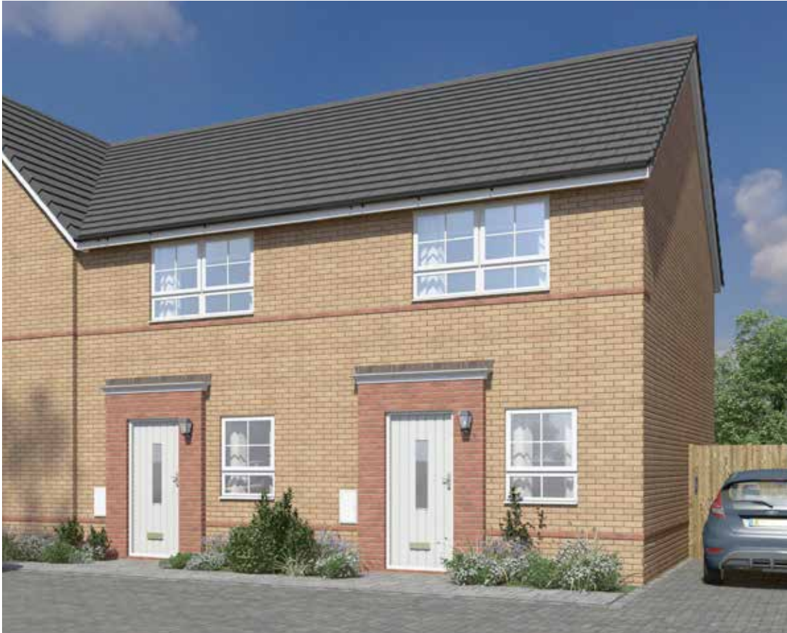
Computer generated image shown.