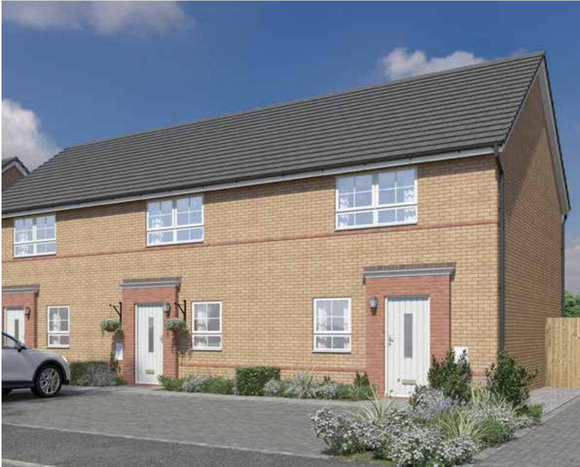
Computer generated image shown.