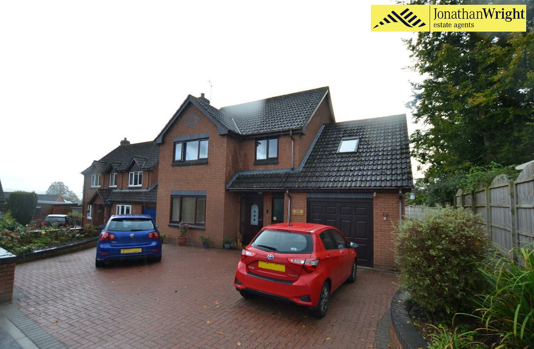
The Paddock Mayern Close, Leominster, HR6 8PU. £434,950