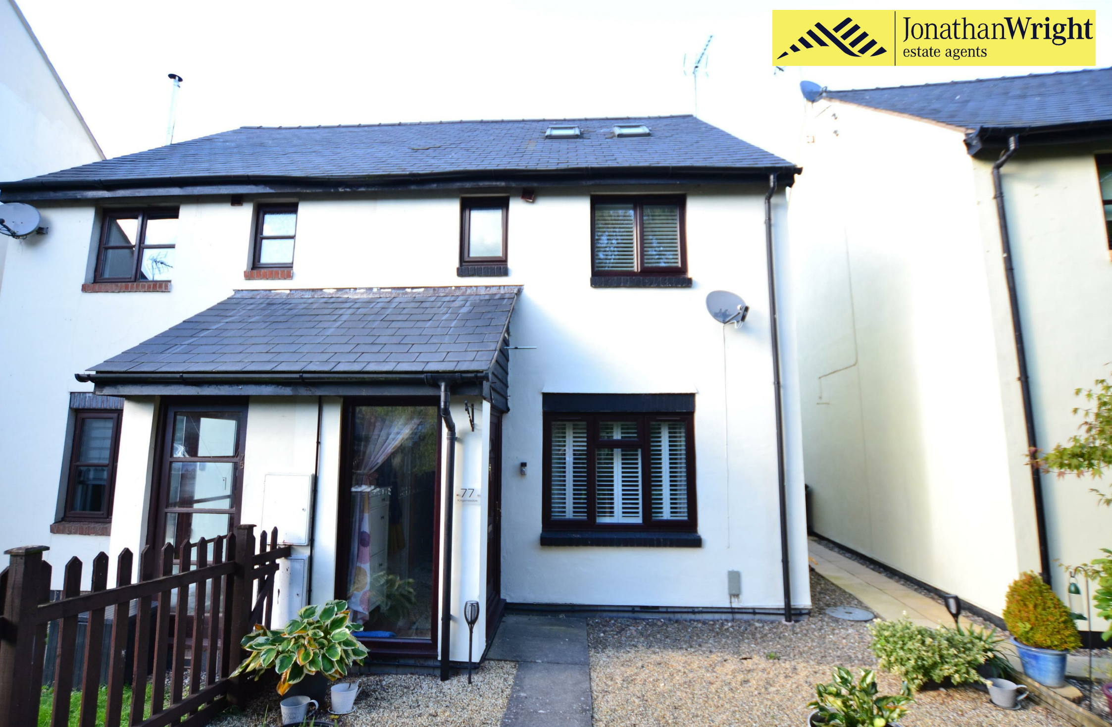
77 Kings Meadow, Wigmore, HR6 9UY. £240,000