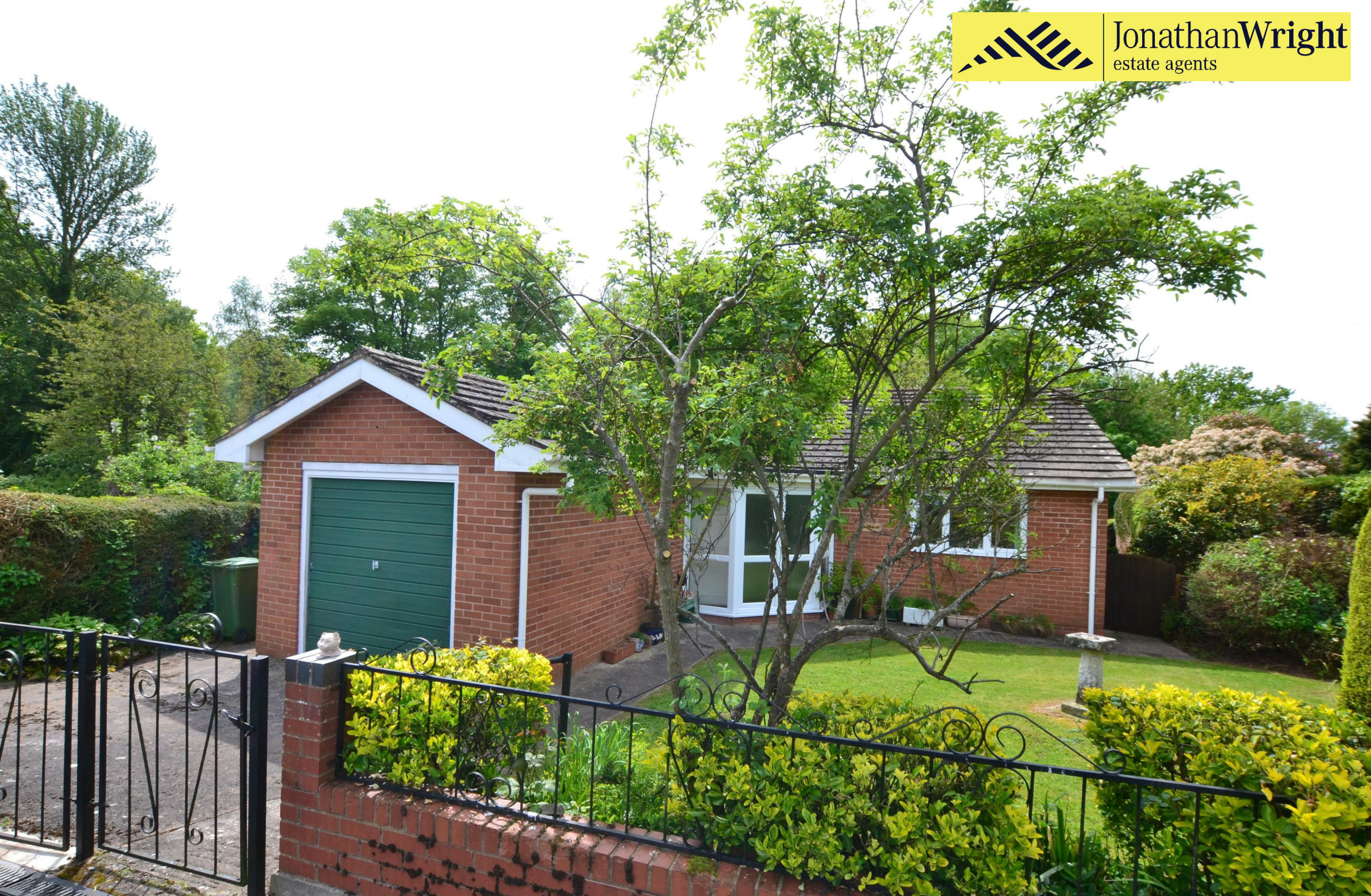
Bradnor, Ryelands Grove, Leominster, Herefordshire HR6 8QA. £343,000