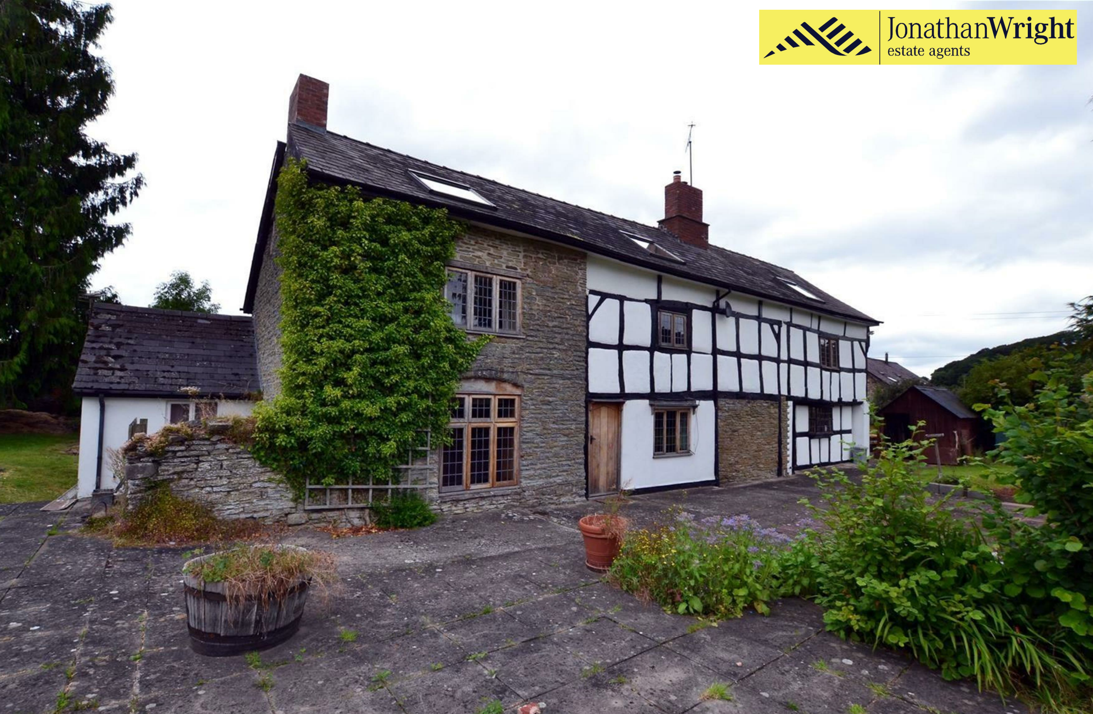
Manor Cottages, Yatton, Nr Leominster, HR6 9TN. No Onward Chain £800,000