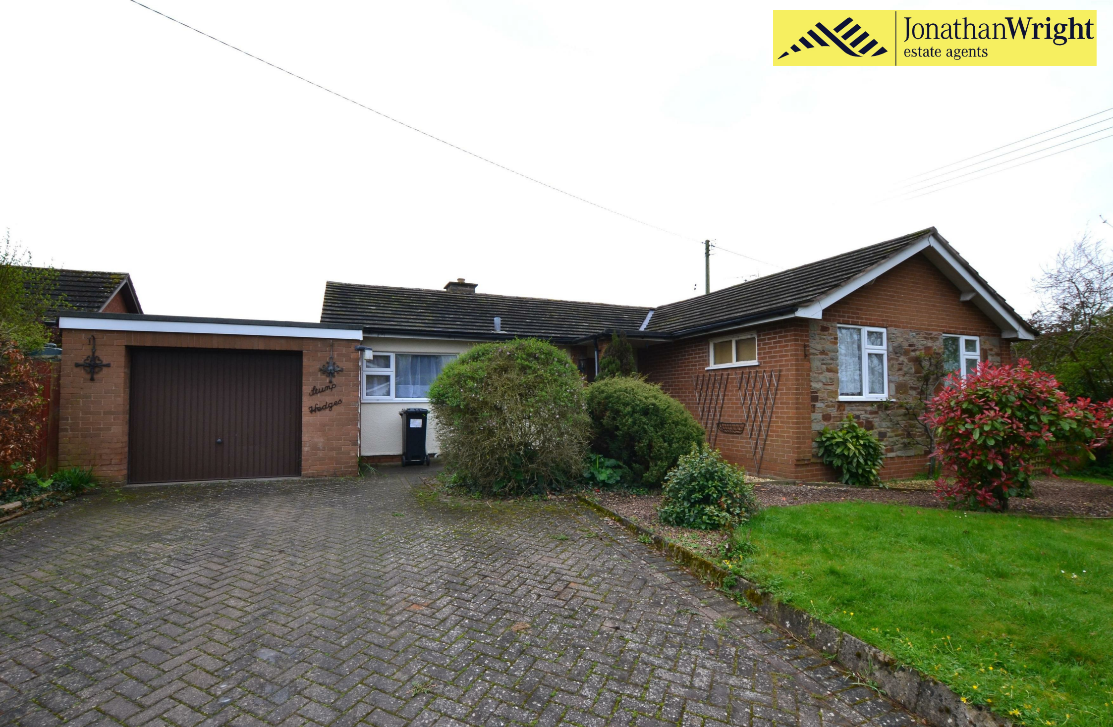
Stump Hedges Paradise Green, Nr Hereford, HR1 3DW. No Onward Chain £400,000