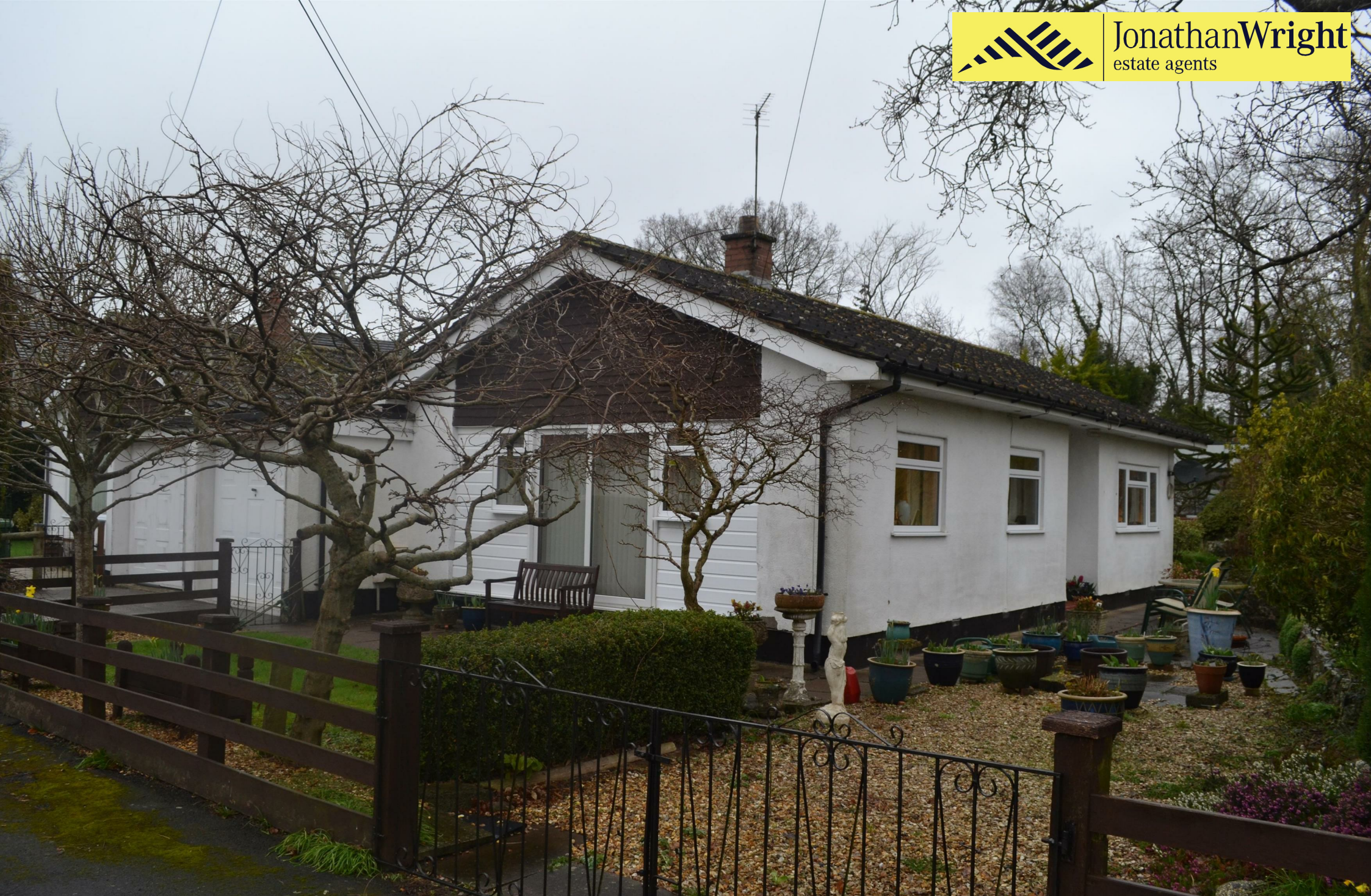
1a The Birches, Shobdon, Herefordshire HR6 9NG. £279,950