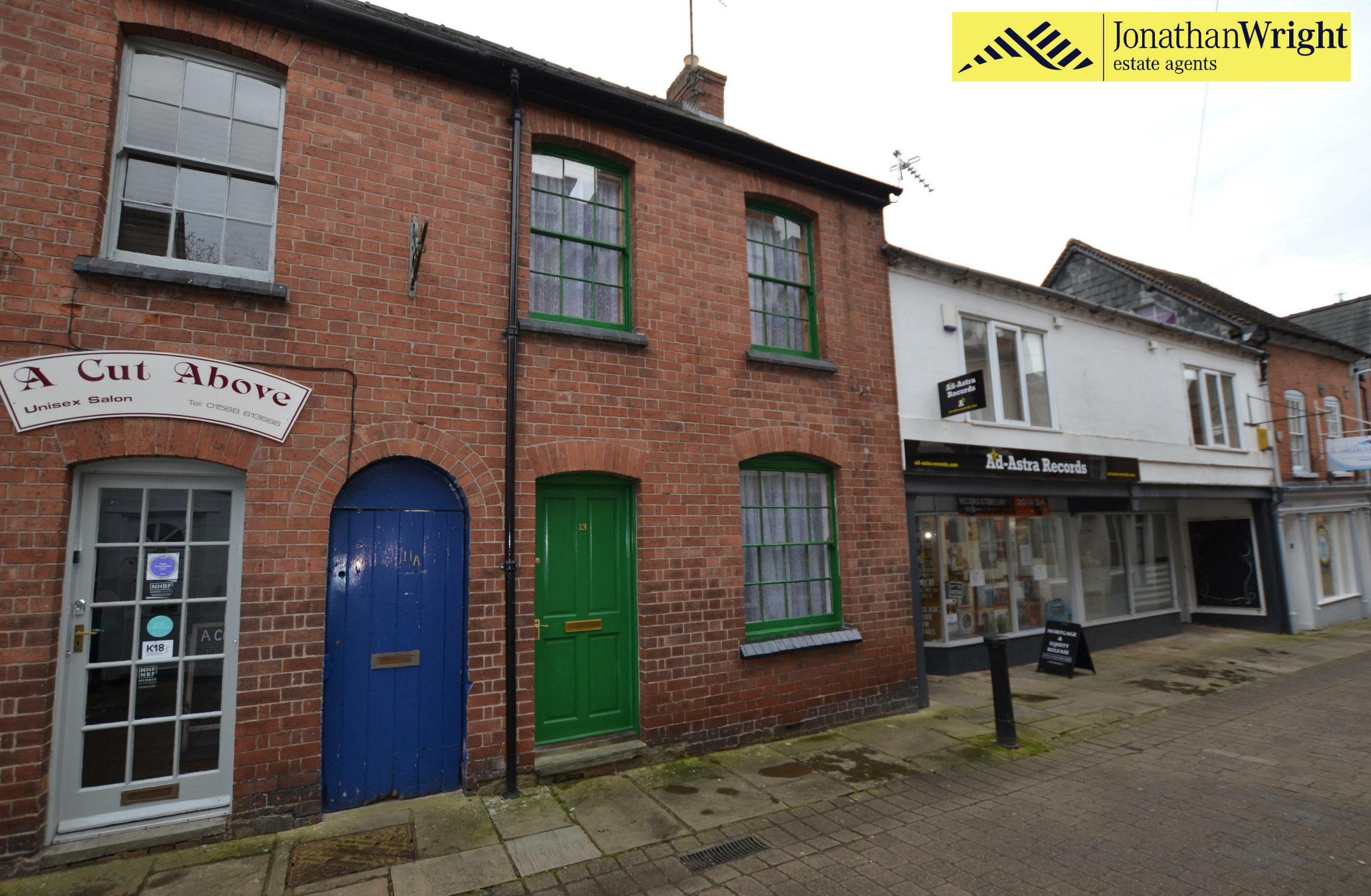
13 School Lane, Leominster, HR6 8AA. No Onward Chain £140,000