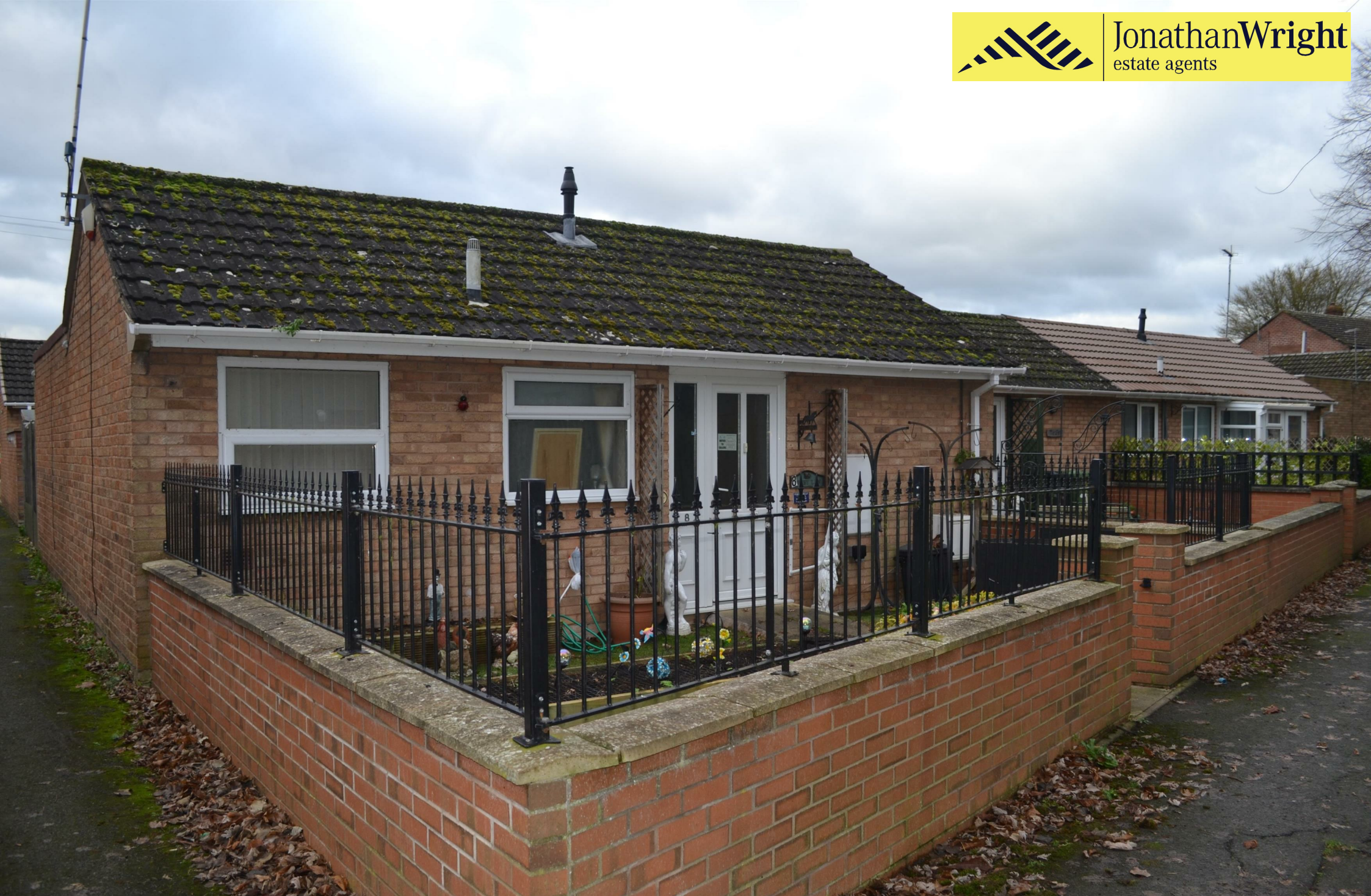
8 Silurian Close, Leominster, HR6 8SR. No Onward Chain £160,000