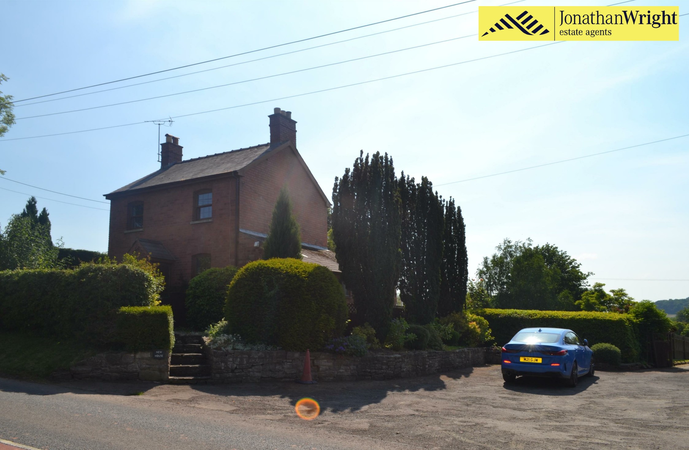
New House , Bush Bank, Herefordshire HR4 8EW. £520,000