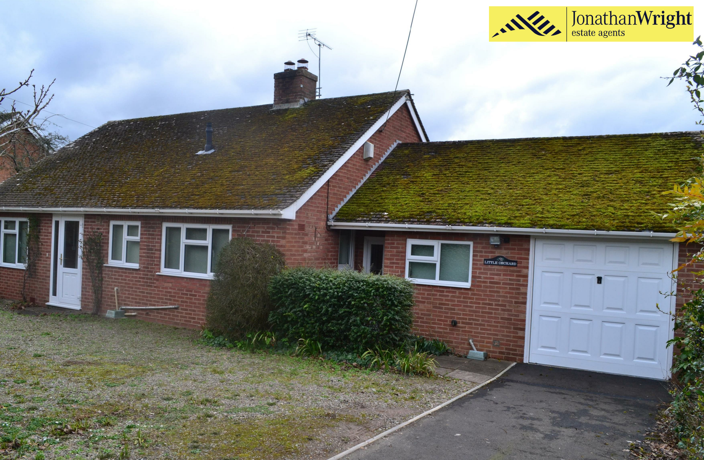
Little Orchard Stockenhill Road, Leominster, HR6 8PP. No Onward Chain £395,000