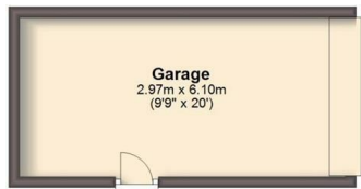
Ground Floor Approx. 66.1 sq. metres (711.4 sq. feet)