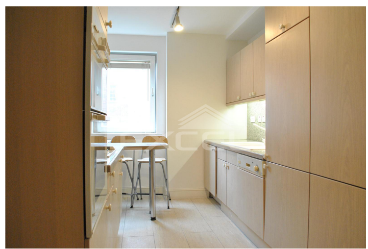
£692 pw [£3,000.00 pcm] [fees apply]