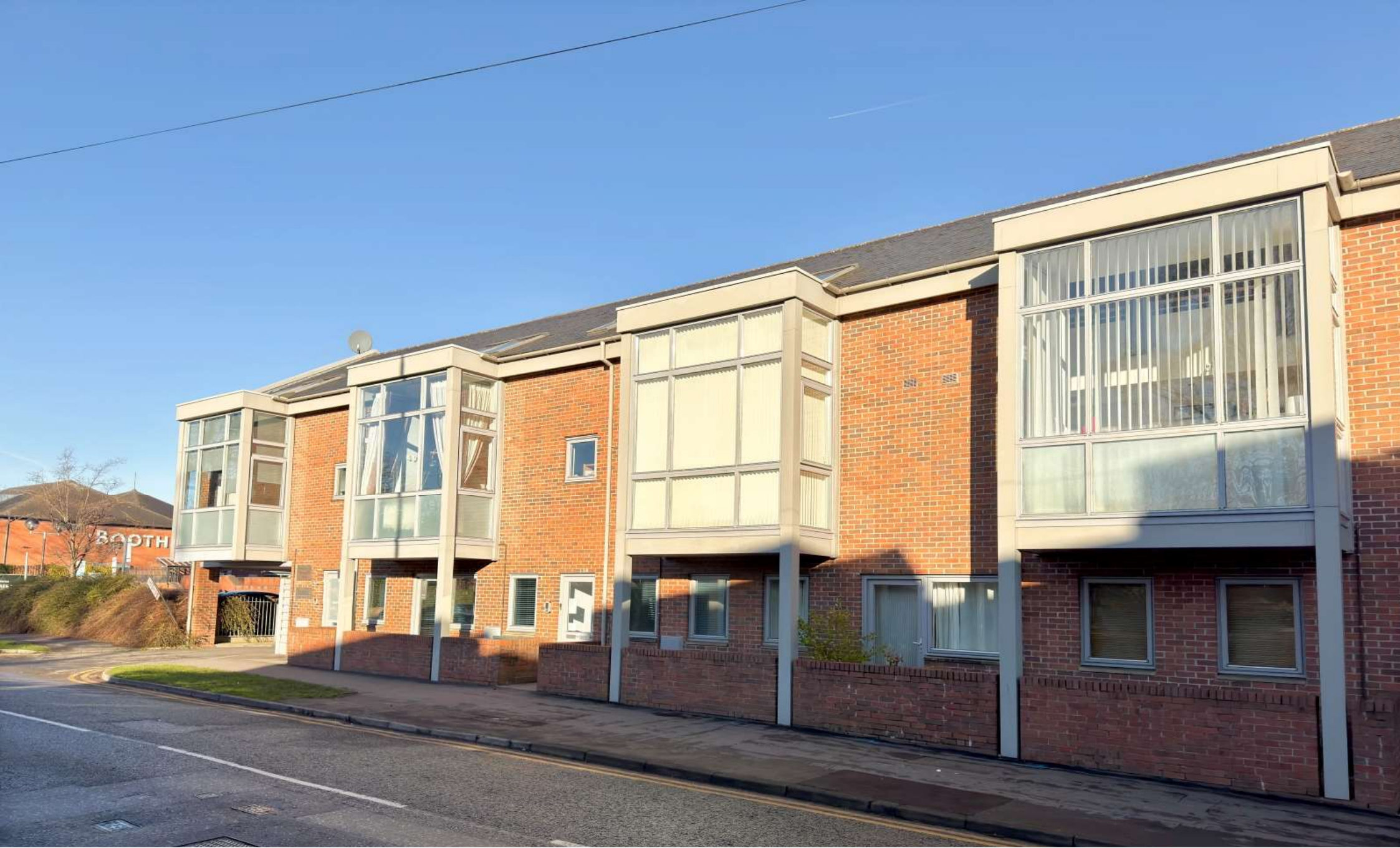
Knutsford Libris Place, Stanley Road