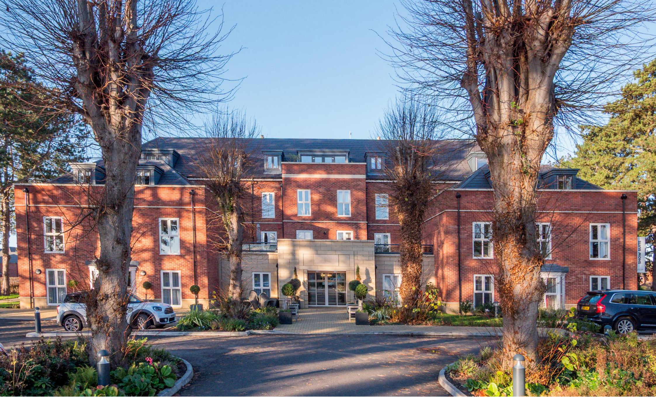
Knutsford Centennial Place, Northwich Road