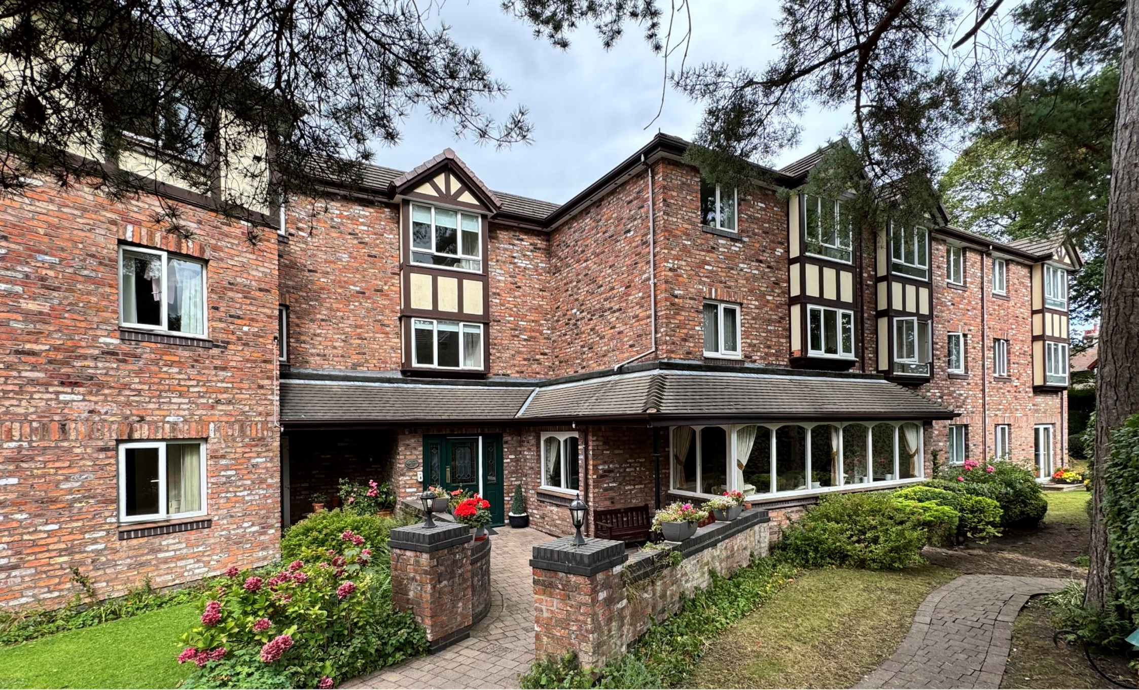
Knutsford Oakwood, Tabley Road