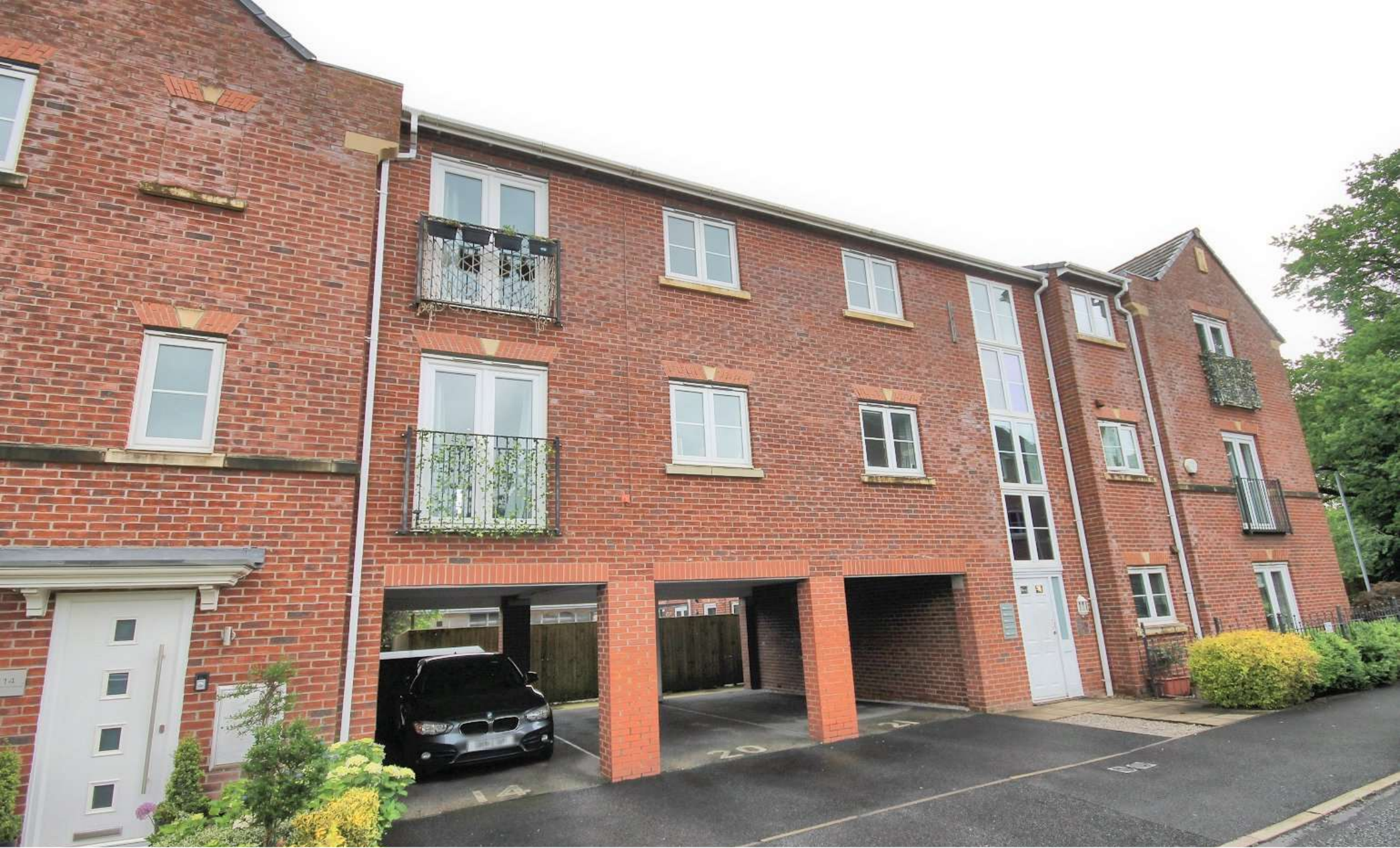
Mobberley Great Oak Square