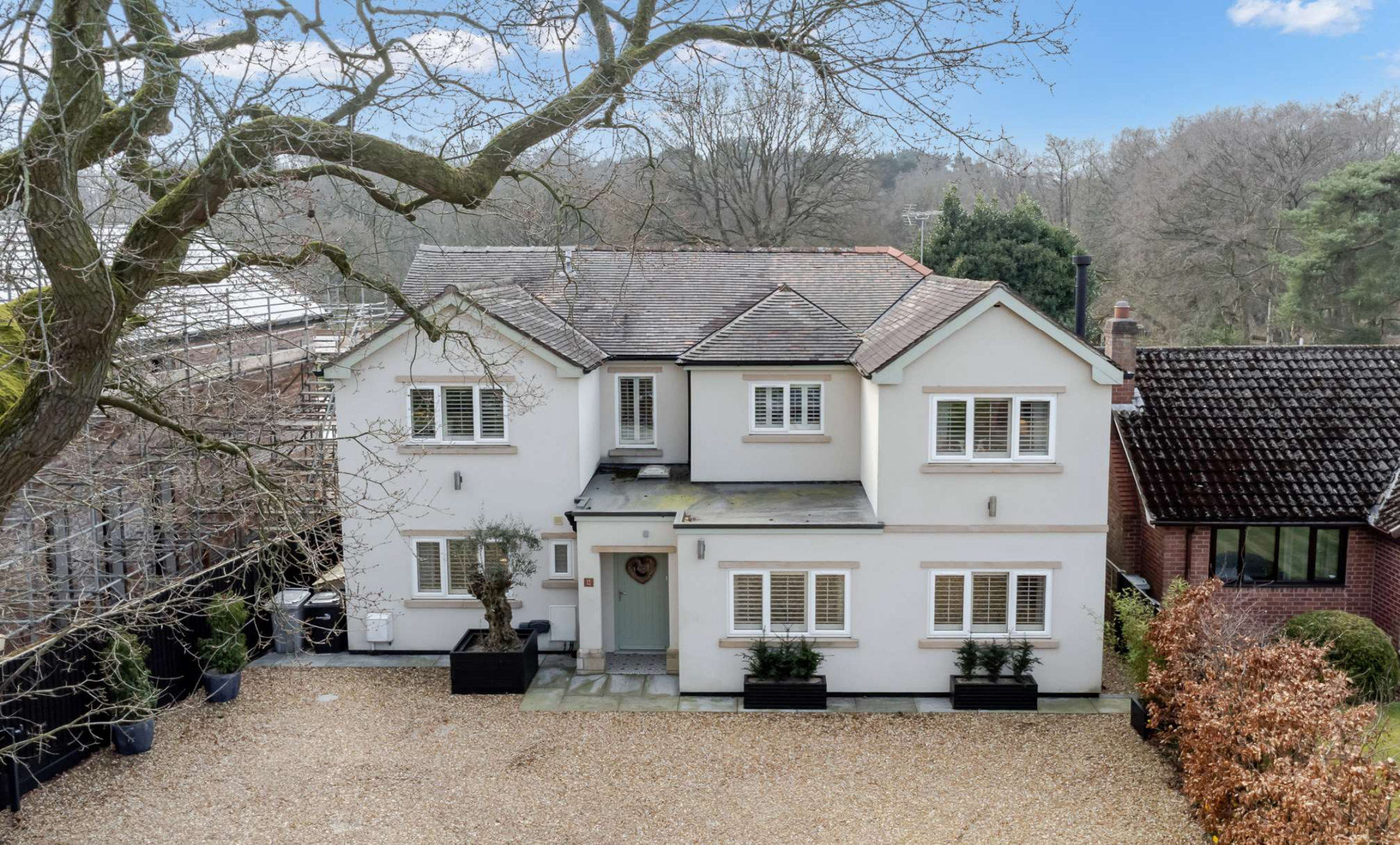
Cranage Northwich Road