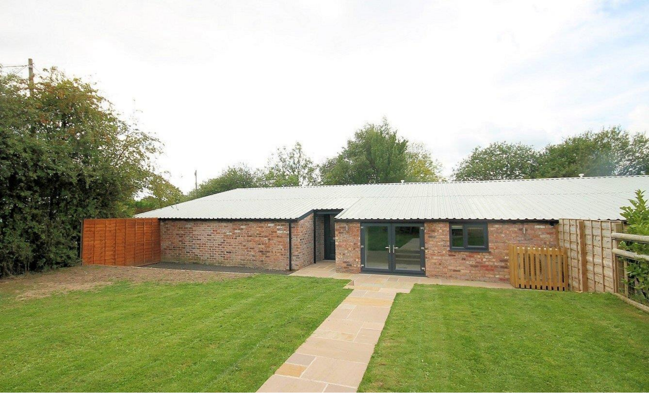
Mobberley Barncroft Farm, Woodend Lane, Mobberley