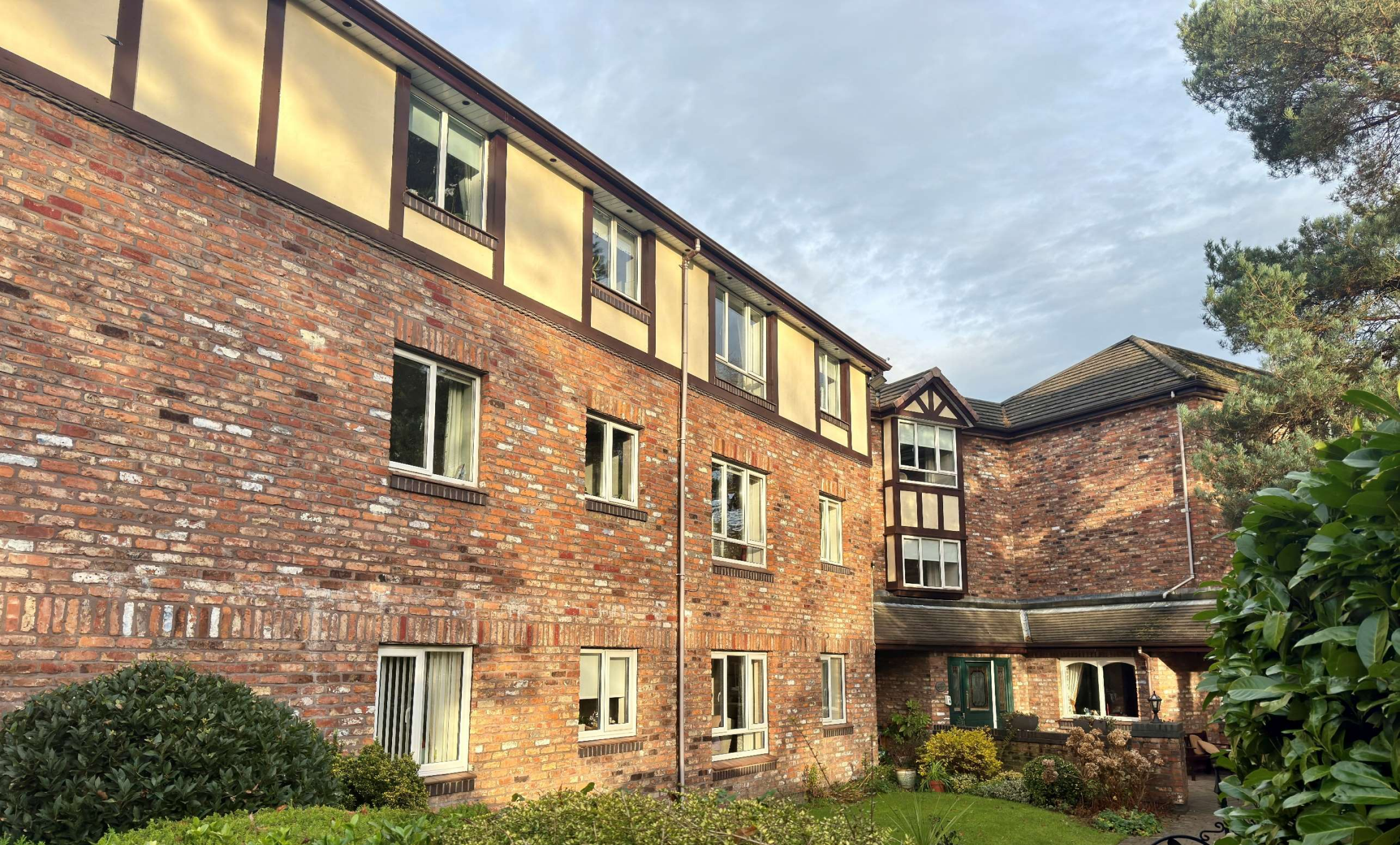
Knutsford Oakwood, Tabley Road