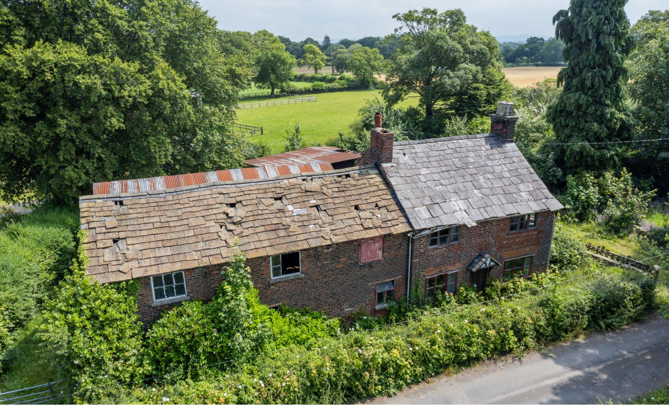
Over Peover Cinder Lane