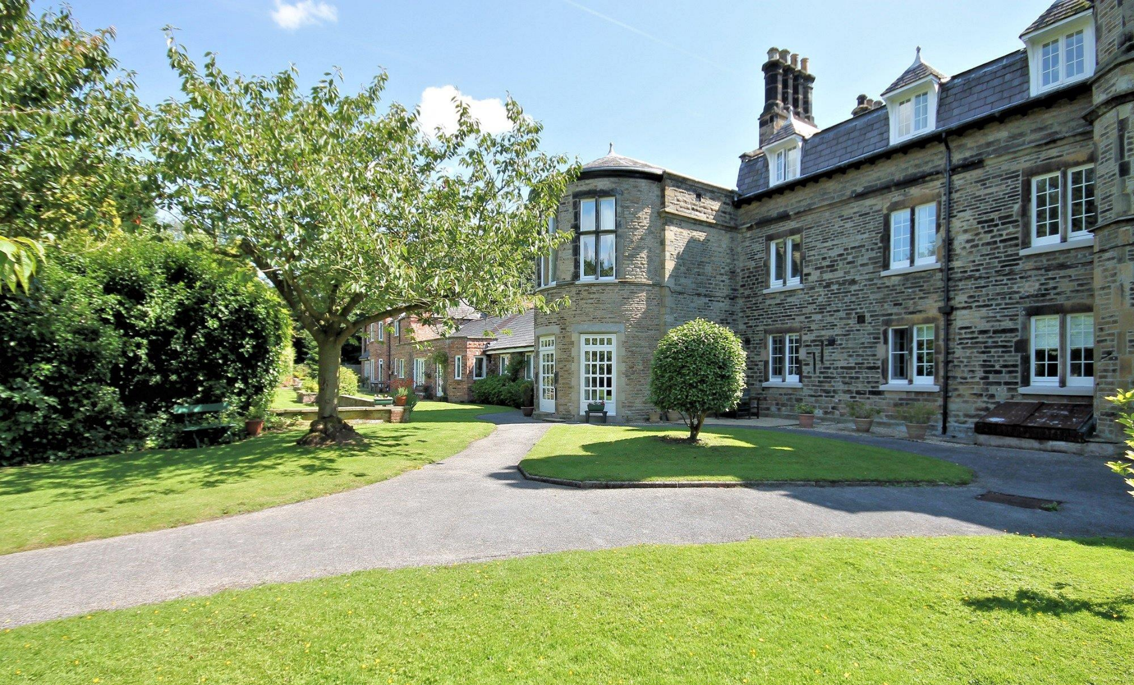
Mobberley Barclay Hall, Hall Lane