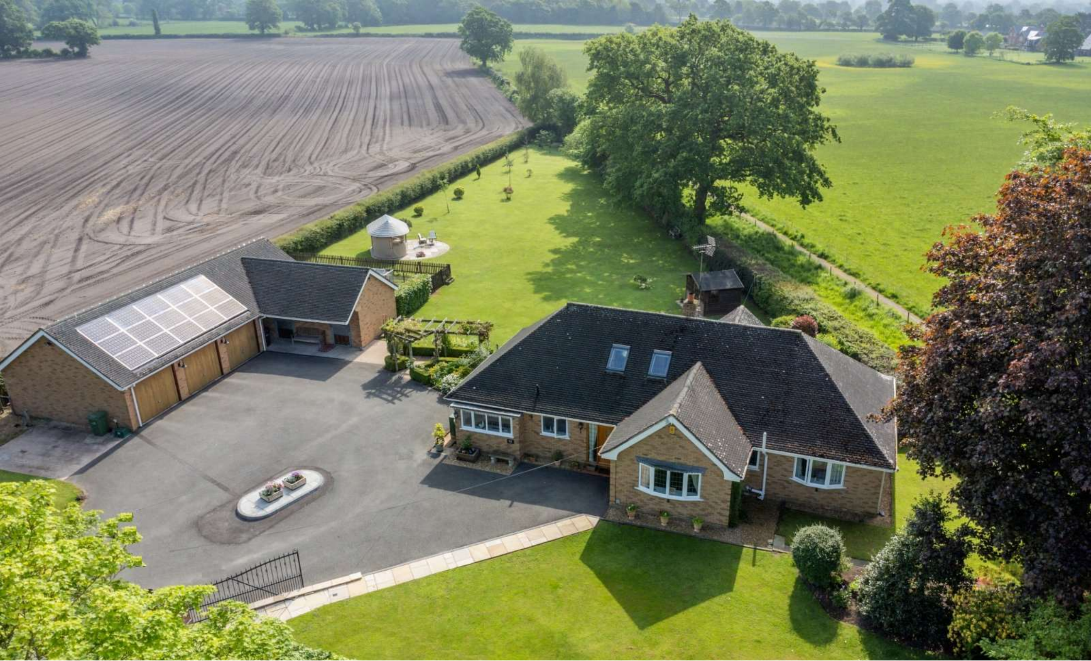
Lower Withington Trap Street