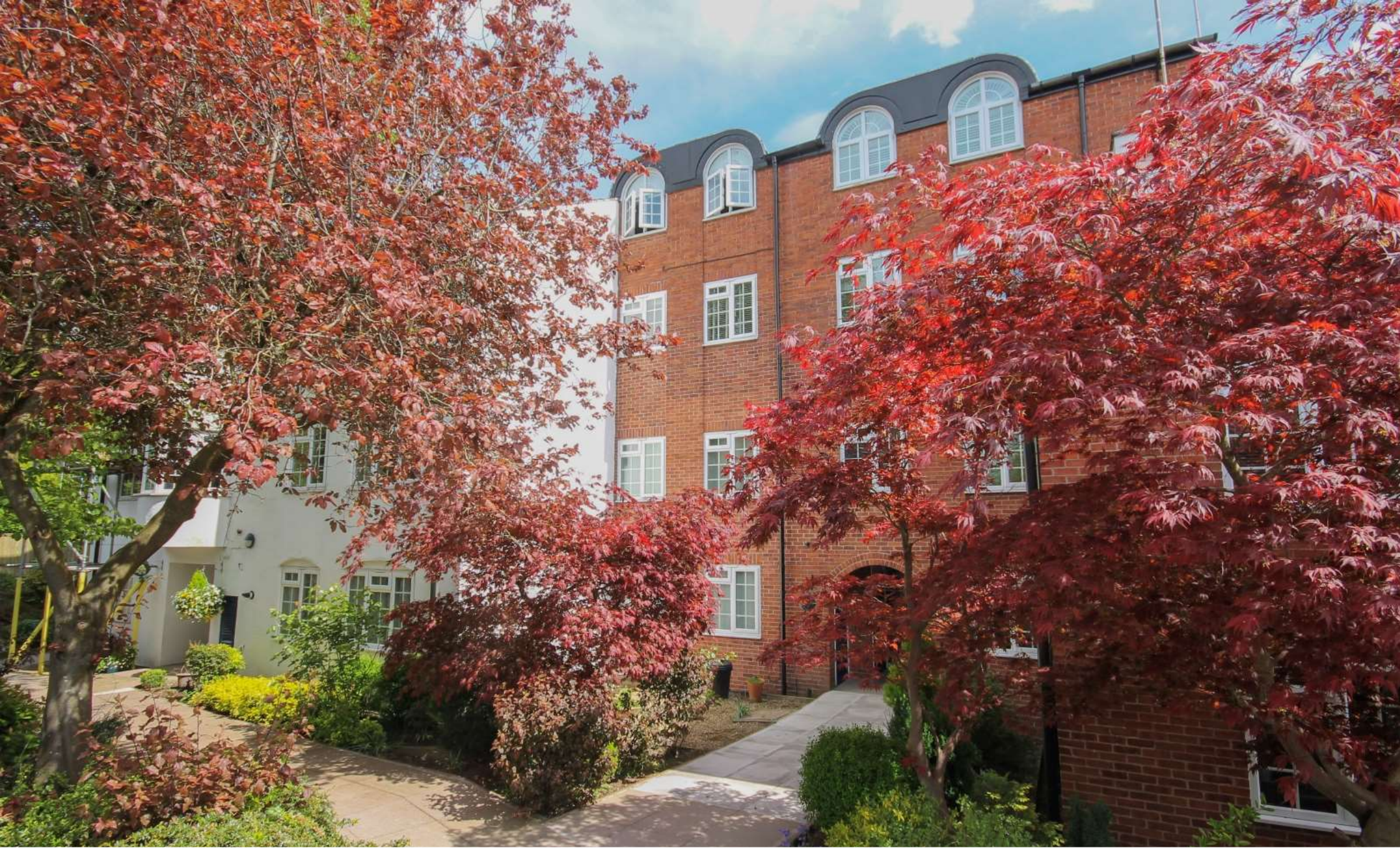
Knutsford Tatton Court, King Street