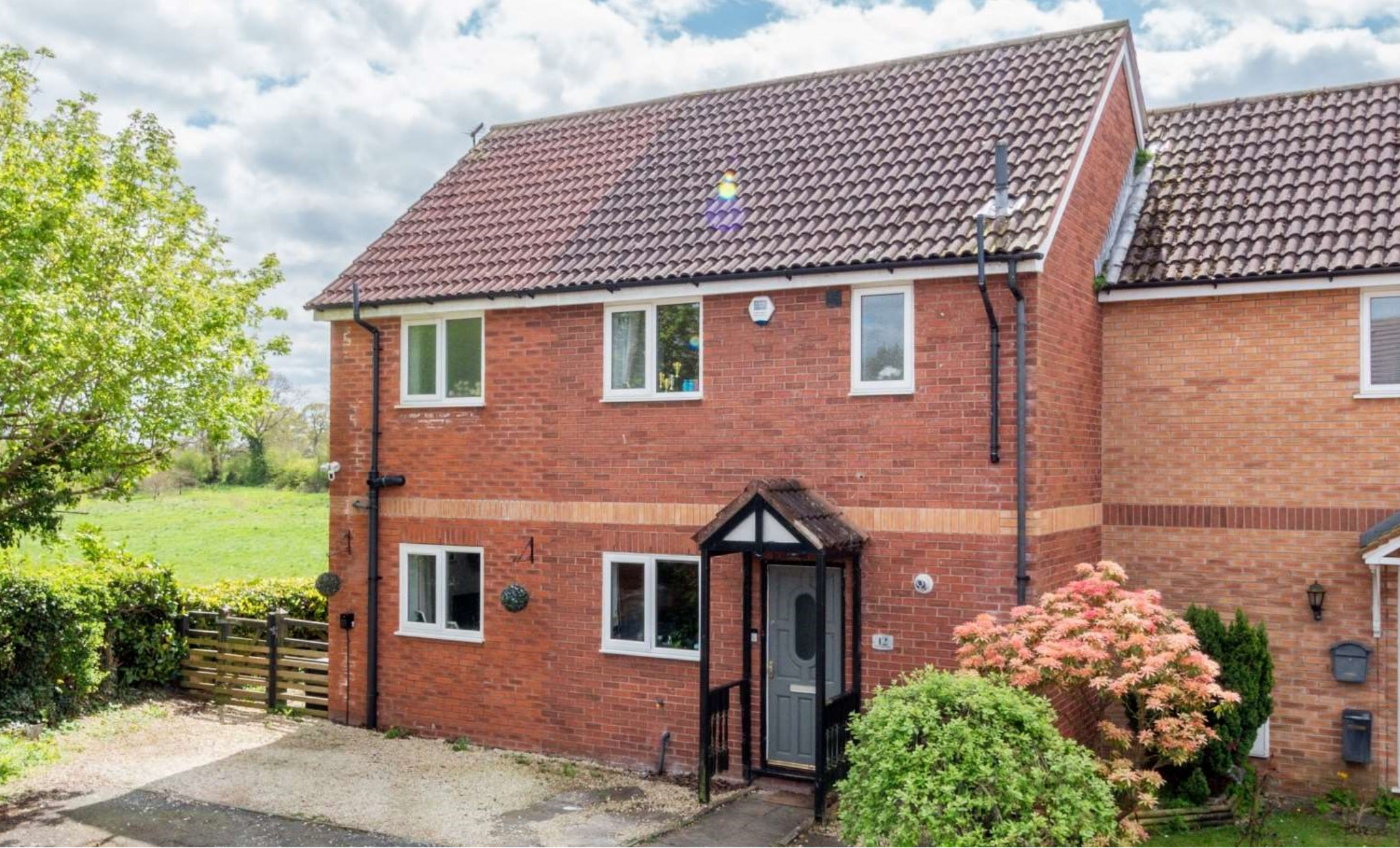
Mobberley Edenfield Close