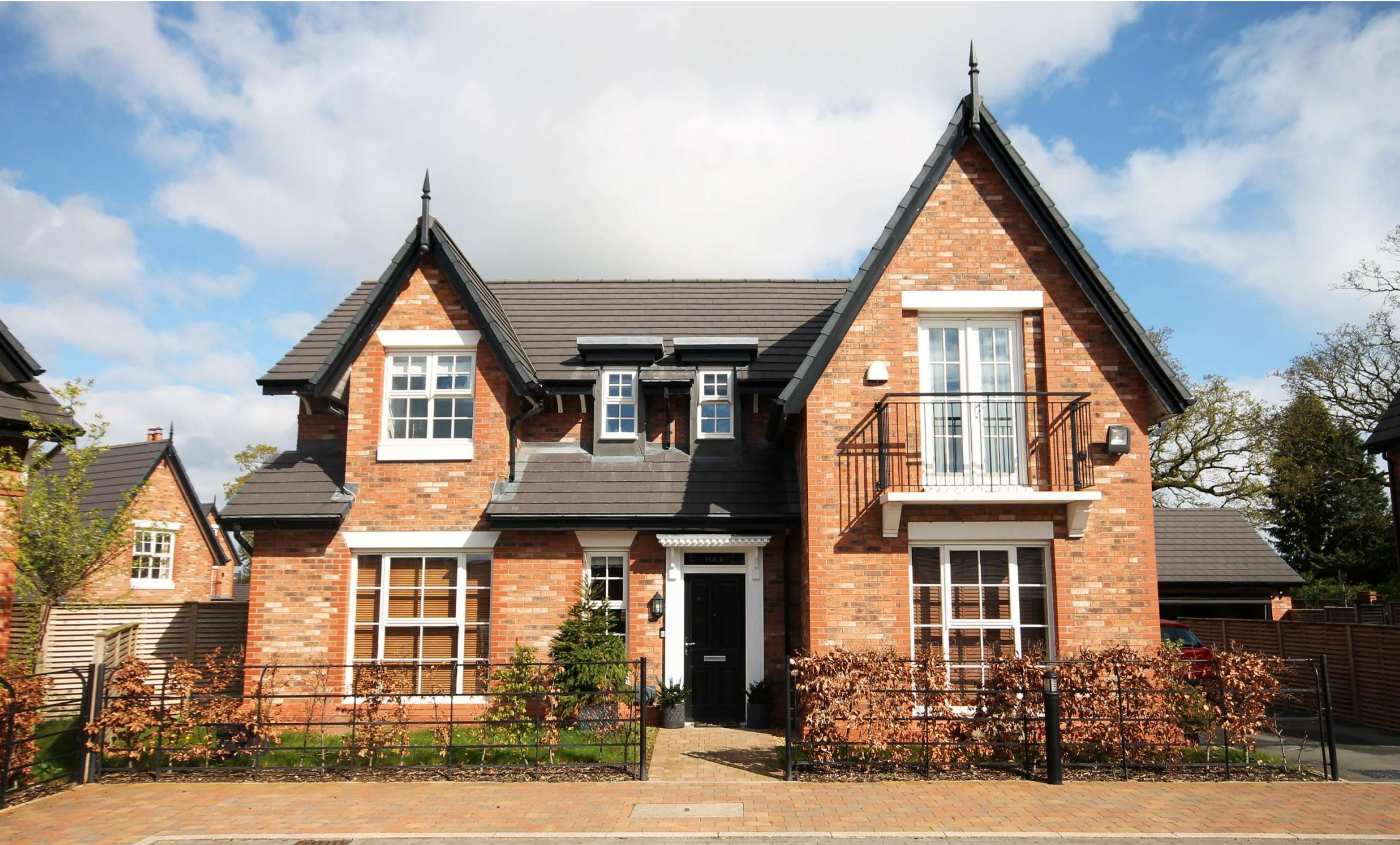
Lower Peover Oak Tree Lane, Middlewich Road