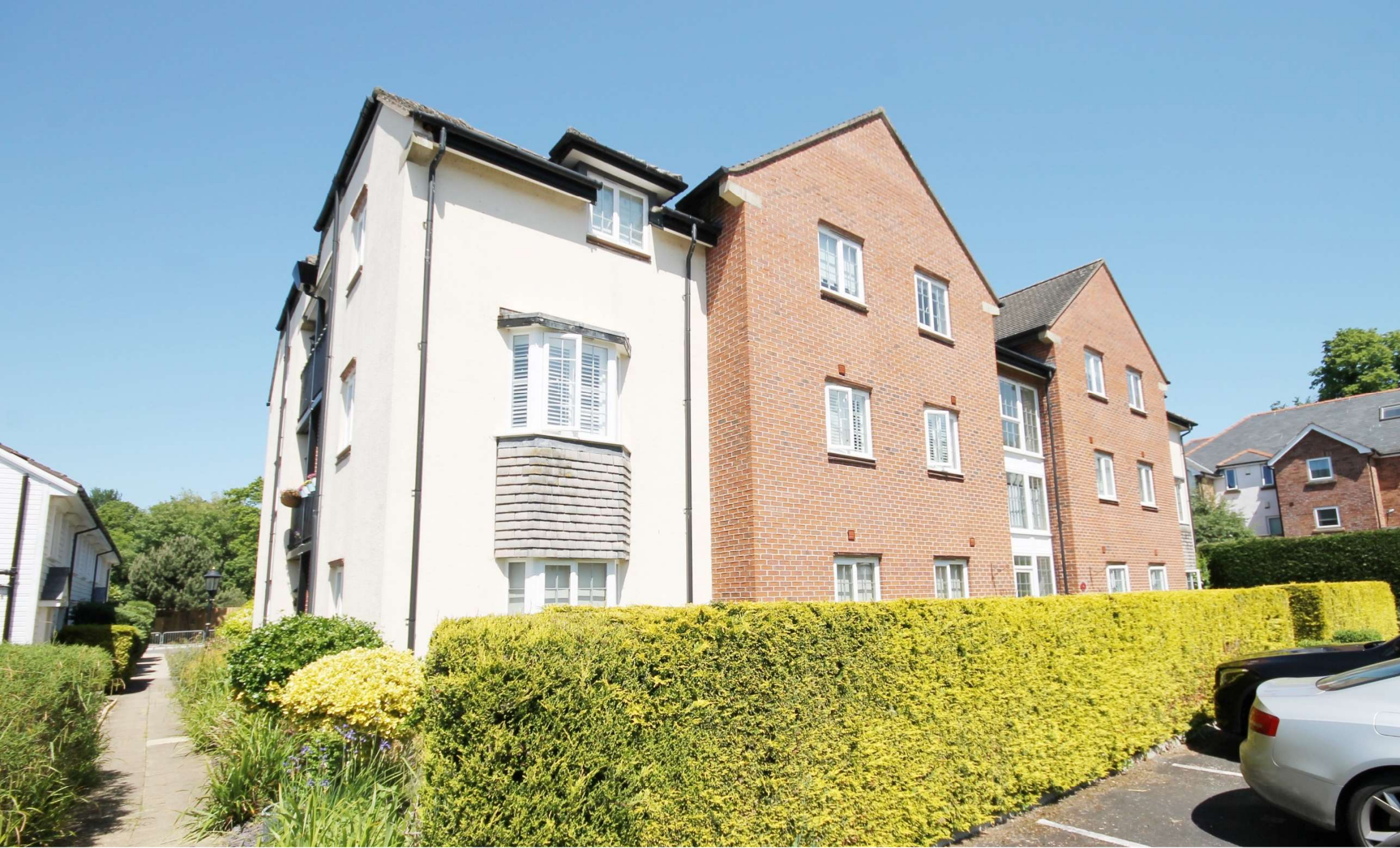
Mobberley The Cedars, Warford Park, Faulkners Lane