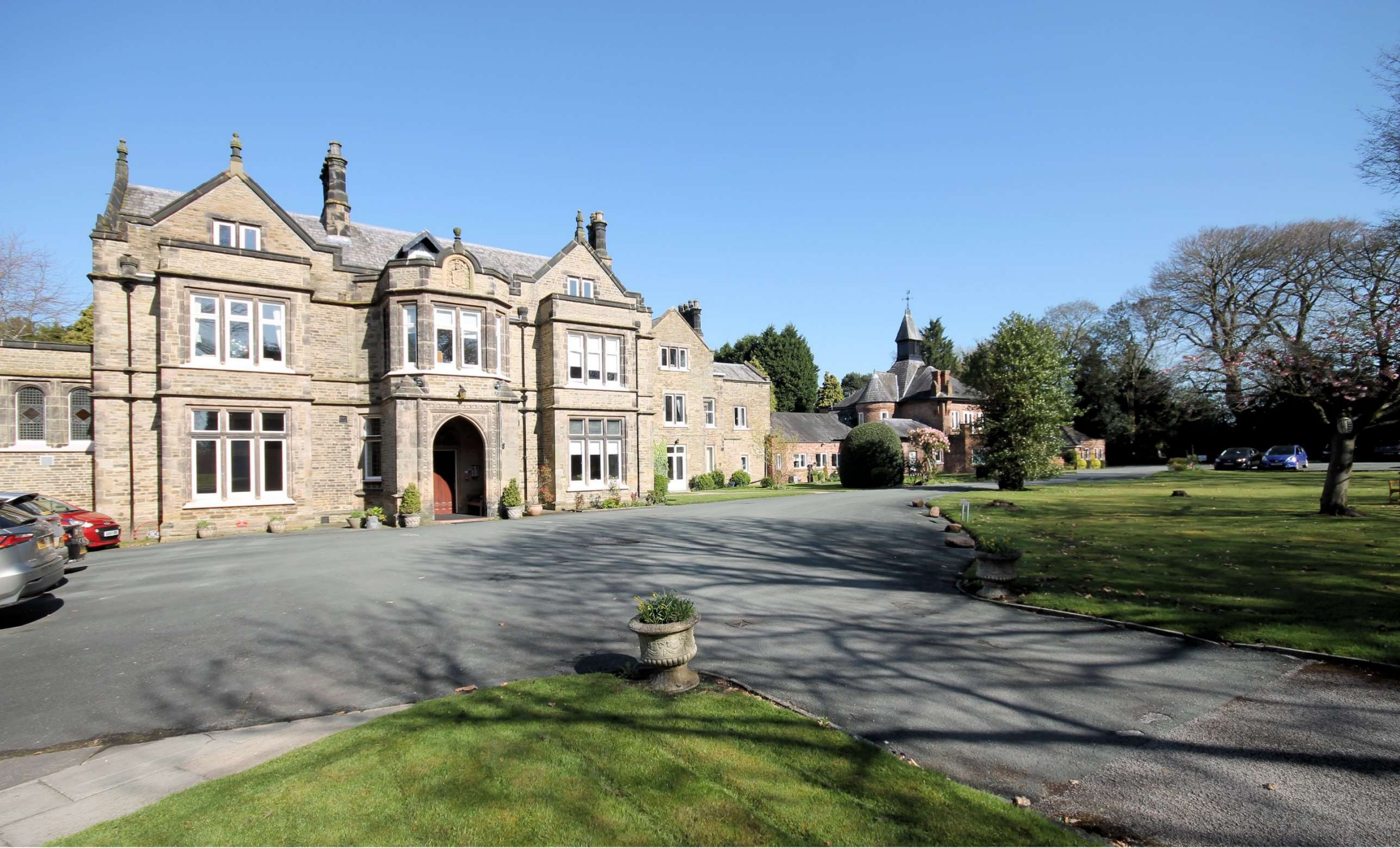
Mobberley Barclay Hall, Hall Lane