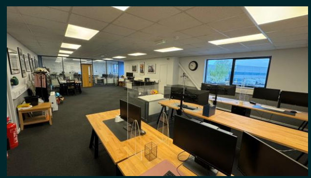
Frrorl Filename not snecified