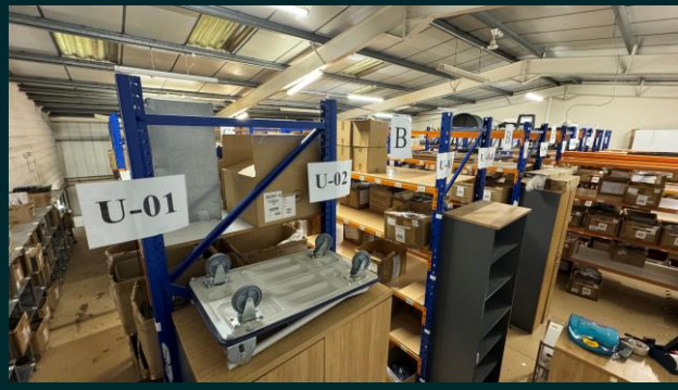
Frrorl Filename not specified