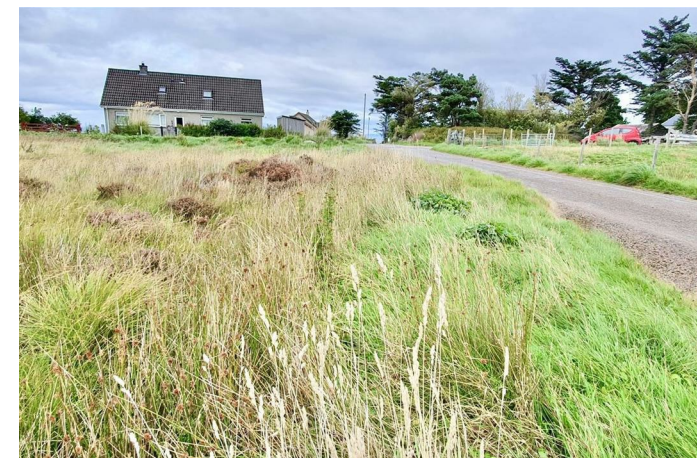
Proposed New House Sand, Laide, Ross-Shire