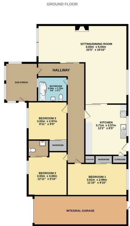
3 BEDROOM BUNGALOW

Whilst every attempt has been made to ensure the accuracy of the floorplan contained here, measurements of floors, windows, rooms and any other items are approximate and no responsibility is taken for any errors, omissions or mis-statements. This plan is for illustrative purposes only and should be used as such by any prospective purchaser. The services, systems and appliances shown have not been tested and no guarantee as to their operability or efficiency can be given. Made with Metrepro ©2024